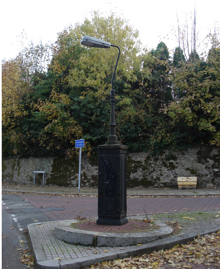
Lamp Standard, Albury Lane (North end), Aldershot