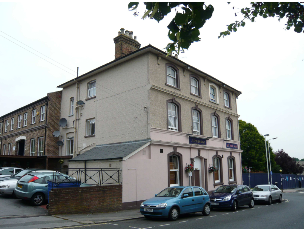
Alexandra Hotel, Alexandra Road, Aldershot – west and south elevations