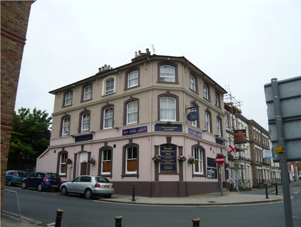
Alexandra Hotel, Alexandra Road, Aldershot – north and west elevations