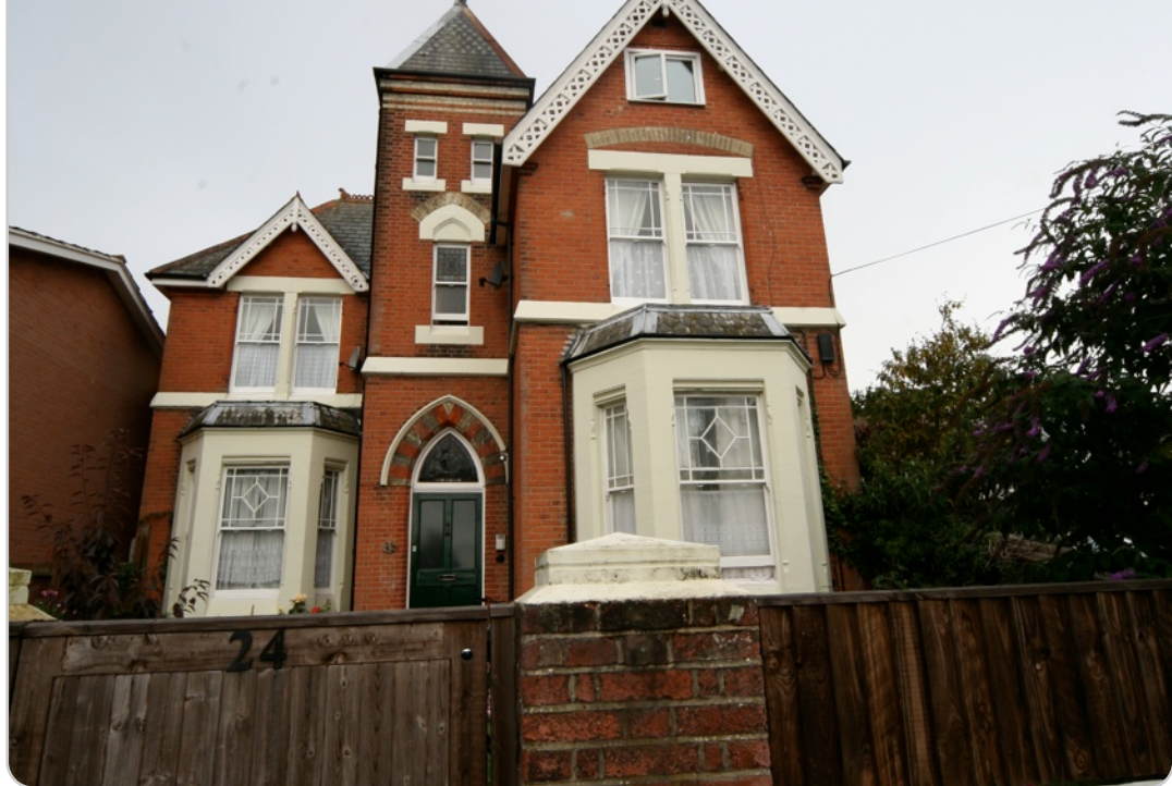
No.24 (E elevation) Cargate Avenue, Aldershot