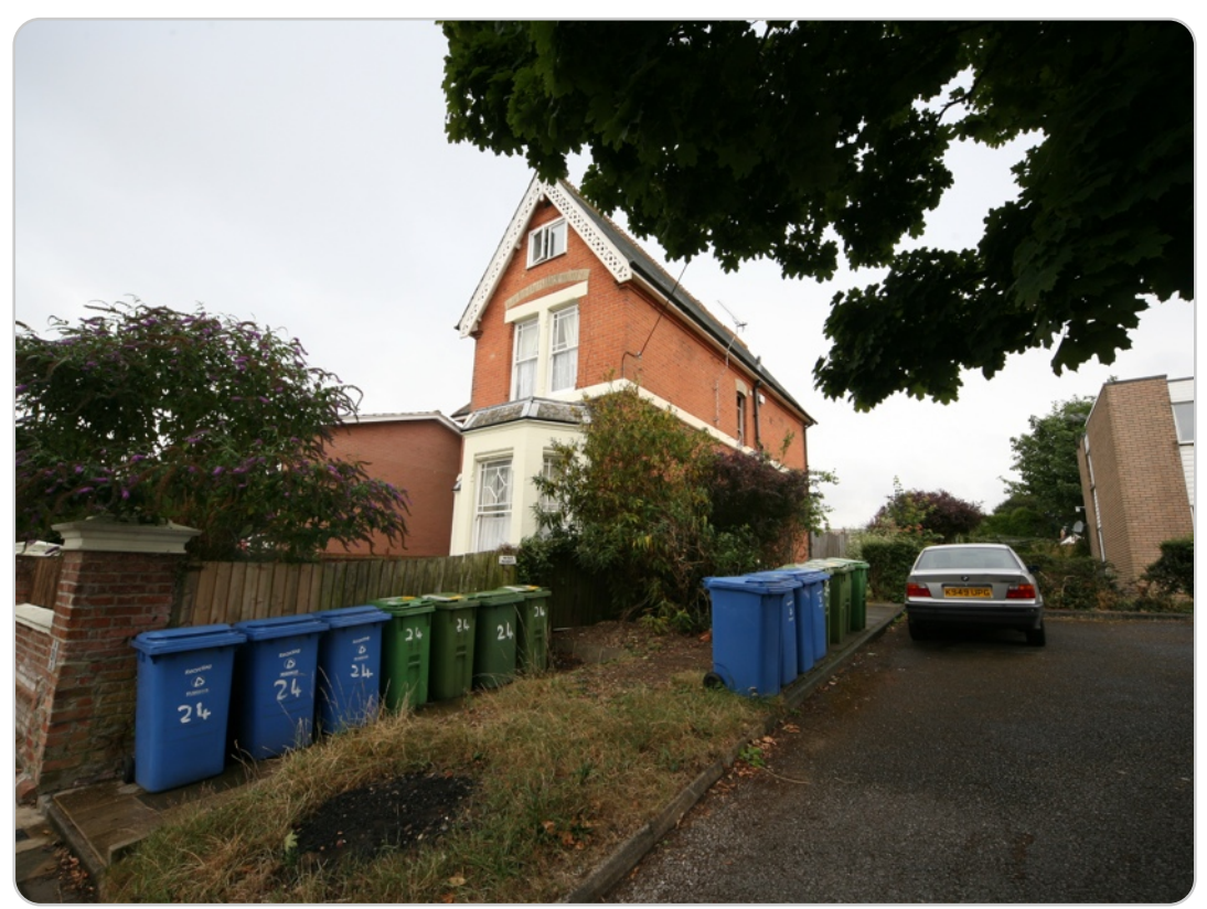
No.24 (N elevation) Cargate Avenue, Aldershot