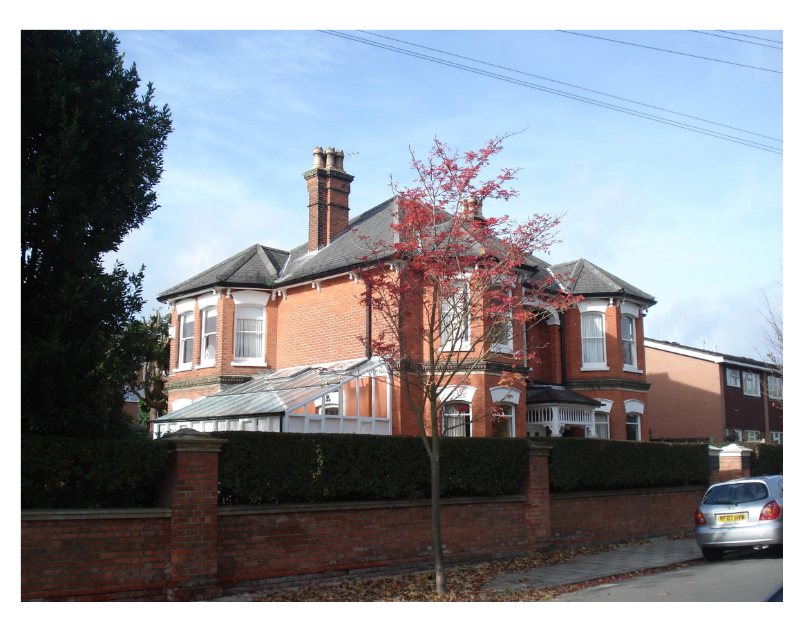
The Beeches, 30 Cargate, Aldershot – south and east elevation