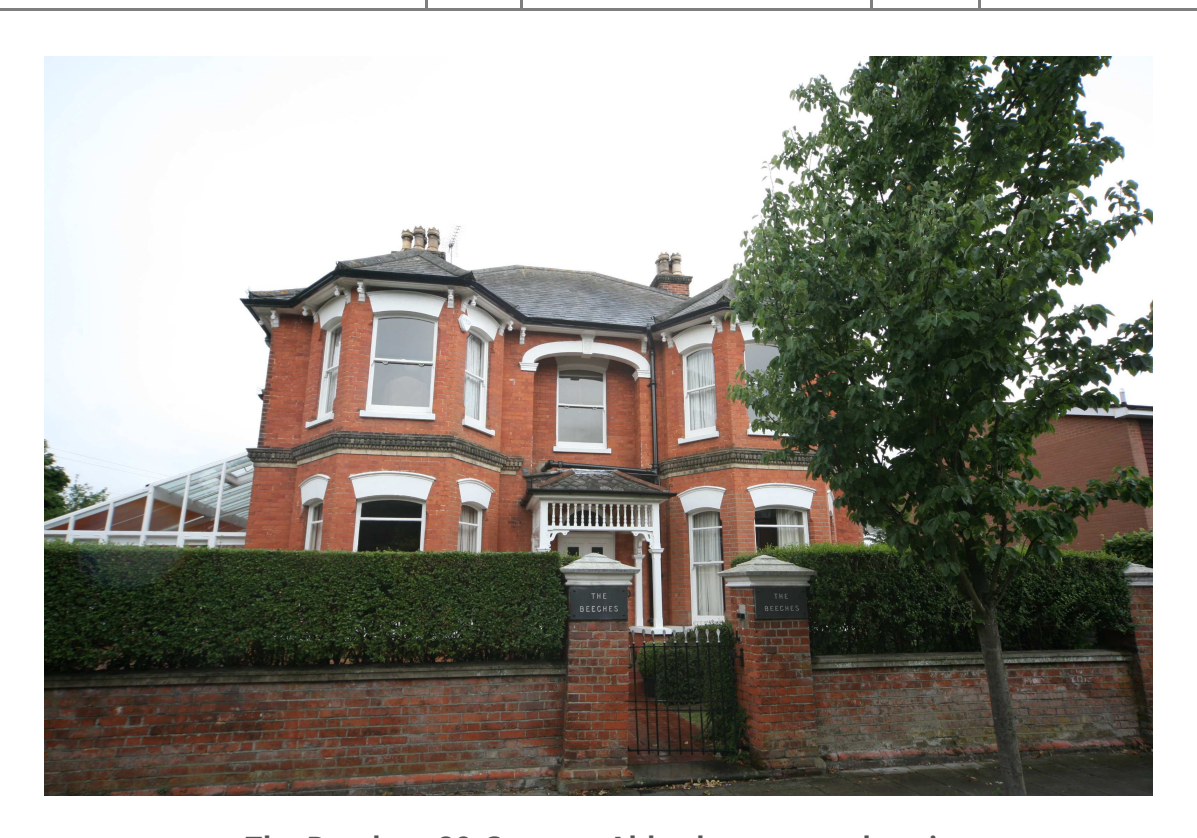
The Beeches, 30 Cargate, Aldershot – east elevation