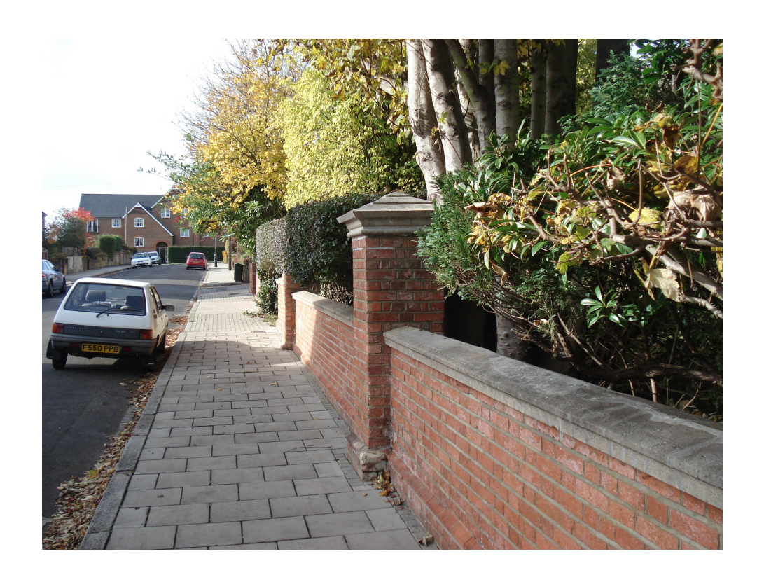
The Beeches, 30 Cargate, Aldershot – boundary wall to Cargate