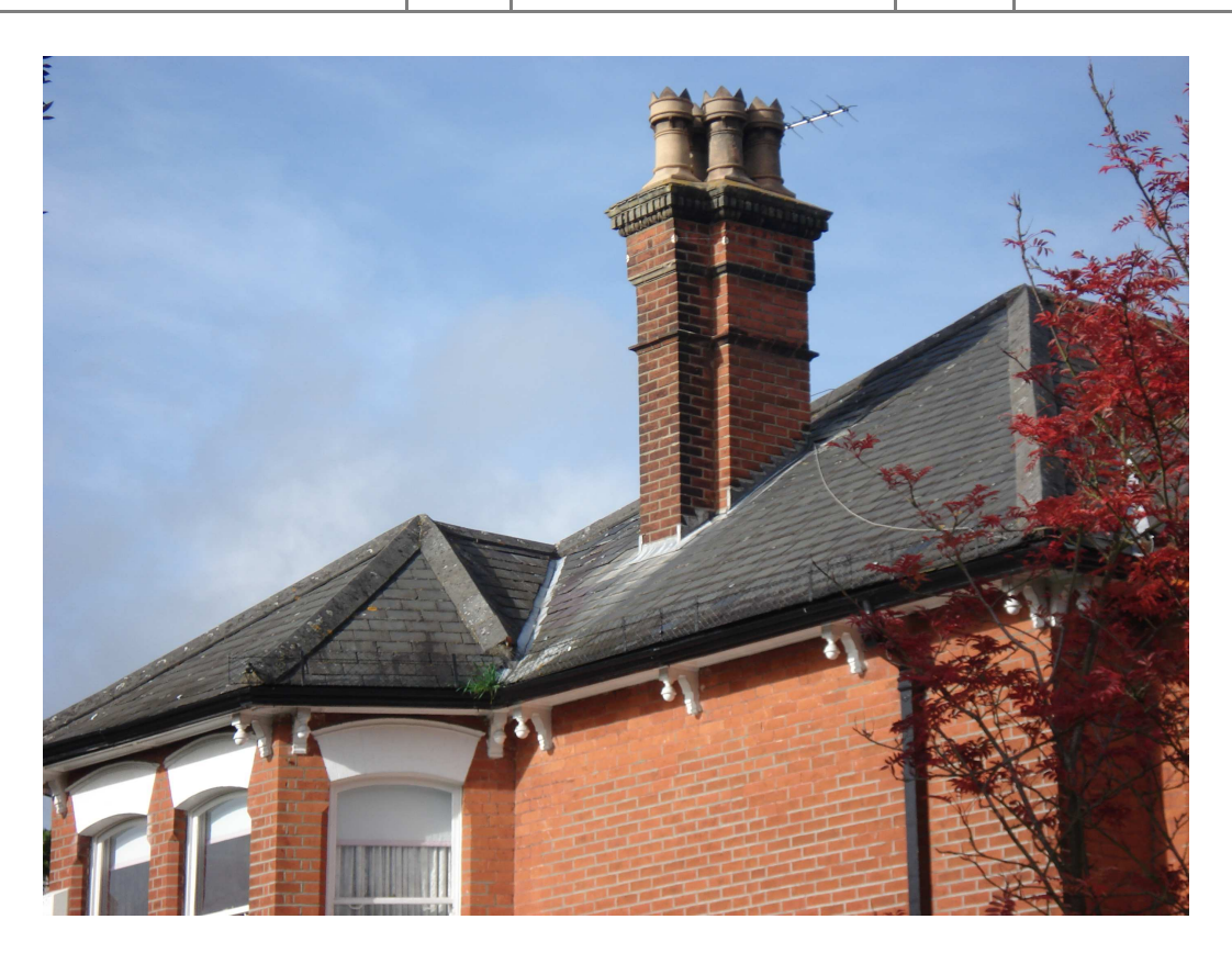
The Beeches, 30 Cargate, Aldershot – roof detail