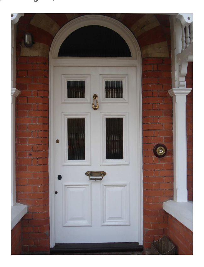
The Beeches, 30 Cargate, Aldershot – front door