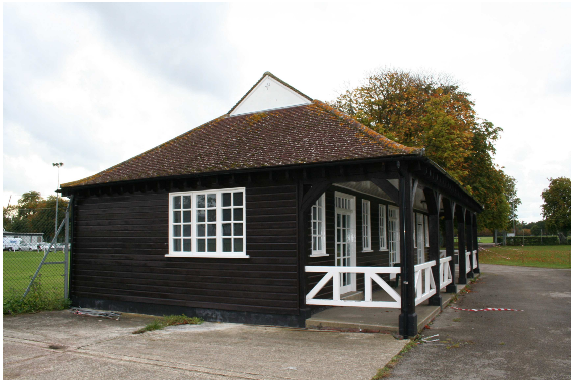
Cricket Pavilion South of Wavell House, Cavans Road, Aldershot – east and north elevations