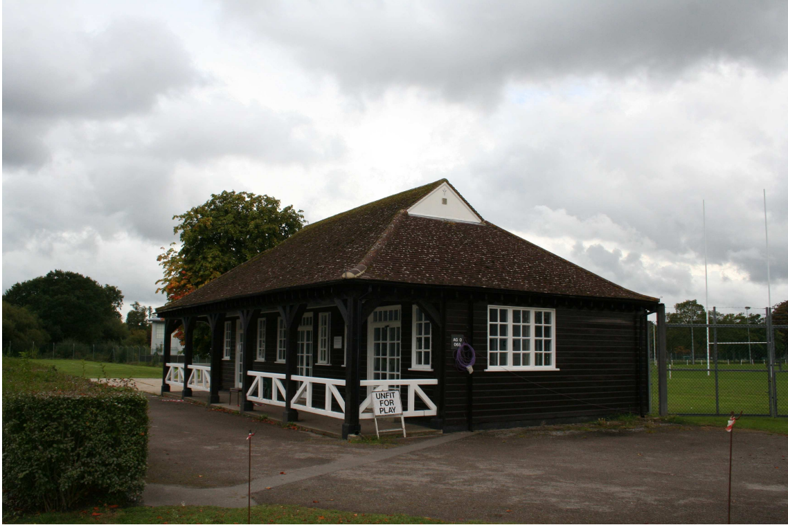
Cricket Pavilion South of Wavell House, Cavans Road, Aldershot – west and north elevations