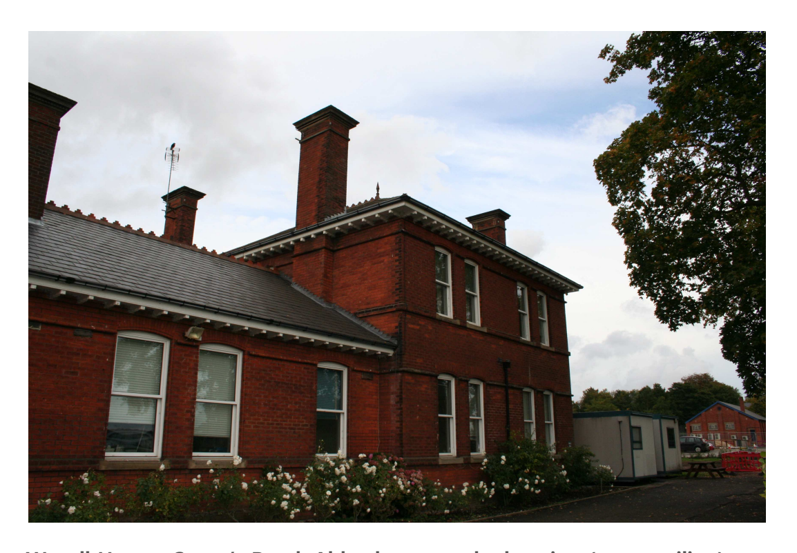
Wavell House, Cavan's Road, Aldershot – south elevation (east pavilion)