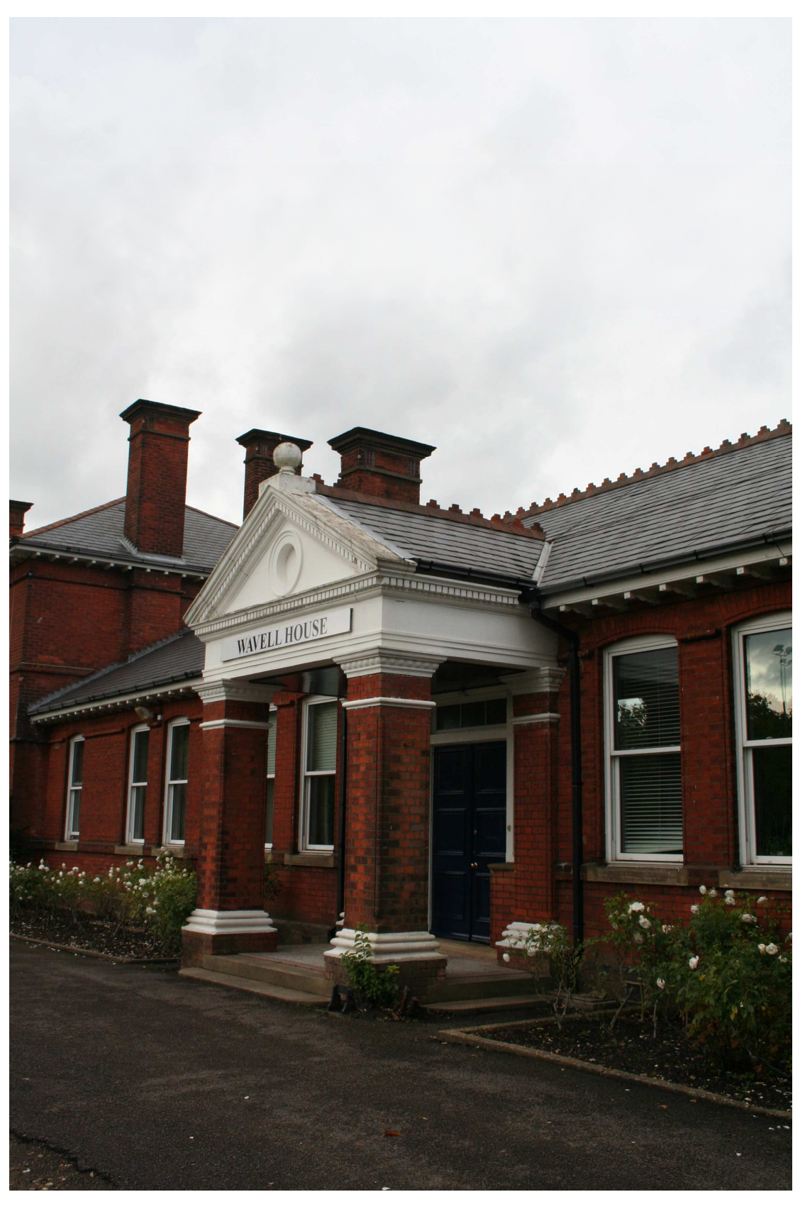
Wavell House, Cavan's Road, Aldershot – portico, south elevation