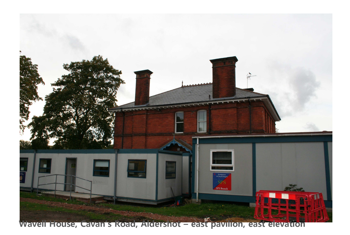
Wavell House, Cavan's Road, Aldershot – west elevation, west pavilion