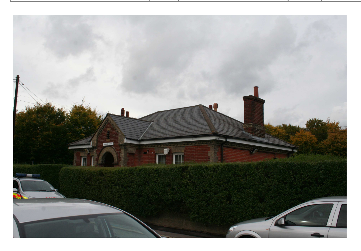
Wavell House, Cavan's Road, Aldershot – Guardroom, forming group with Wavell House