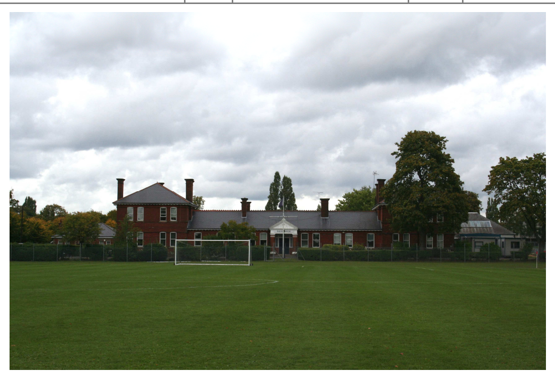
Wavell House, Cavan's Road, Aldershot – setting from south