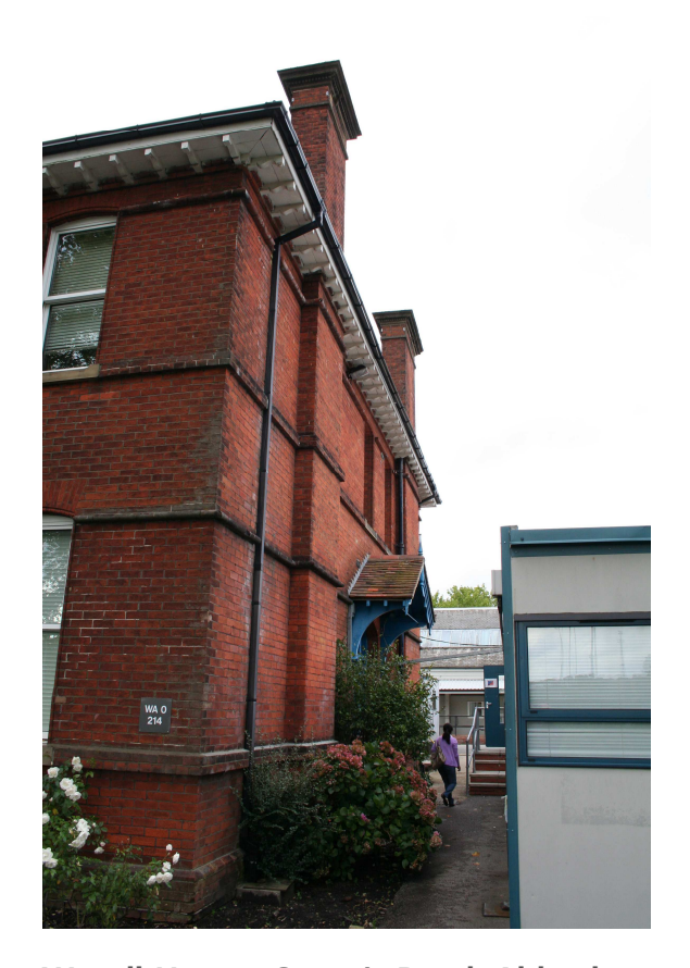
Wavell House, Cavan's Road, Aldershot – east elevation