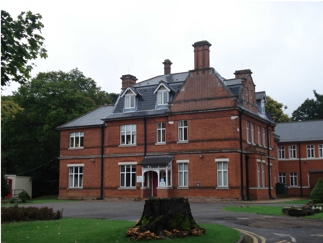
Blandford House, 5 Farnborough Road, Aldershot – south elevation