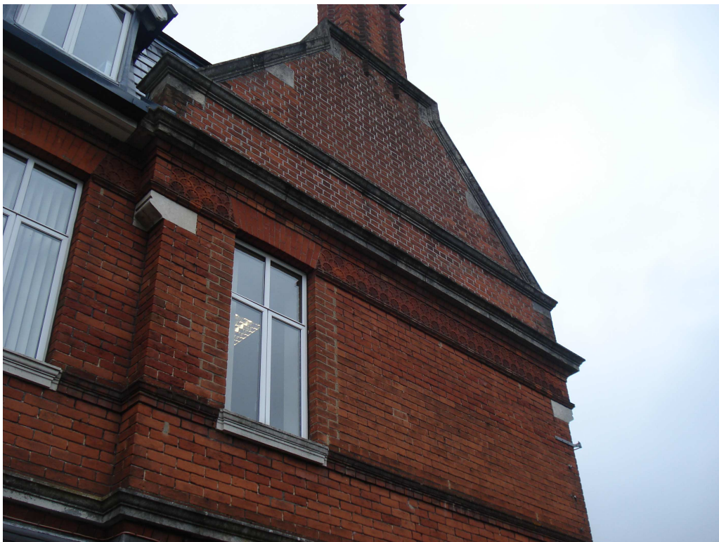
Blandford House, 5 Farnborough Road, Aldershot – gable detail, south elevation