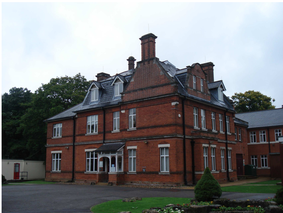
Blandford House, 5 Farnborough Road, Aldershot – south and east elevations