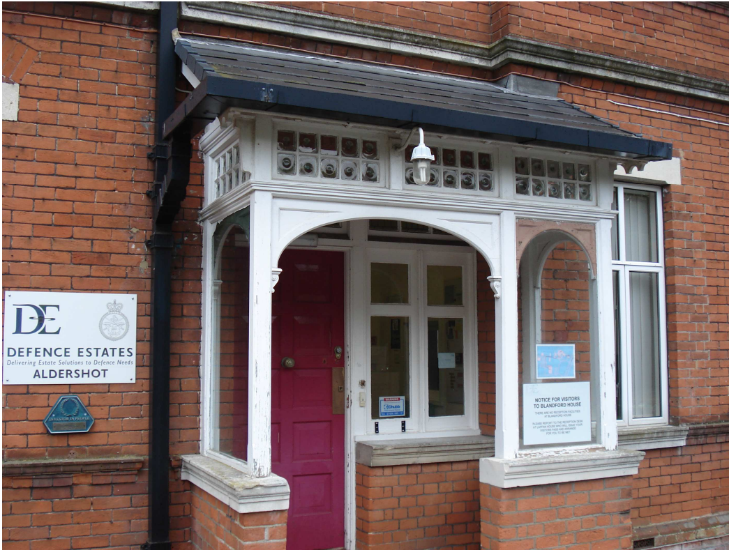
Blandford House, 5 Farnborough Road, Aldershot – porch detail