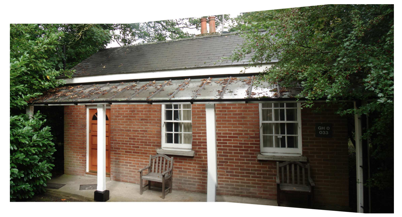
Guardhouse at Government House, Farnborough Road, Aldershot – south elevation (photomontage)