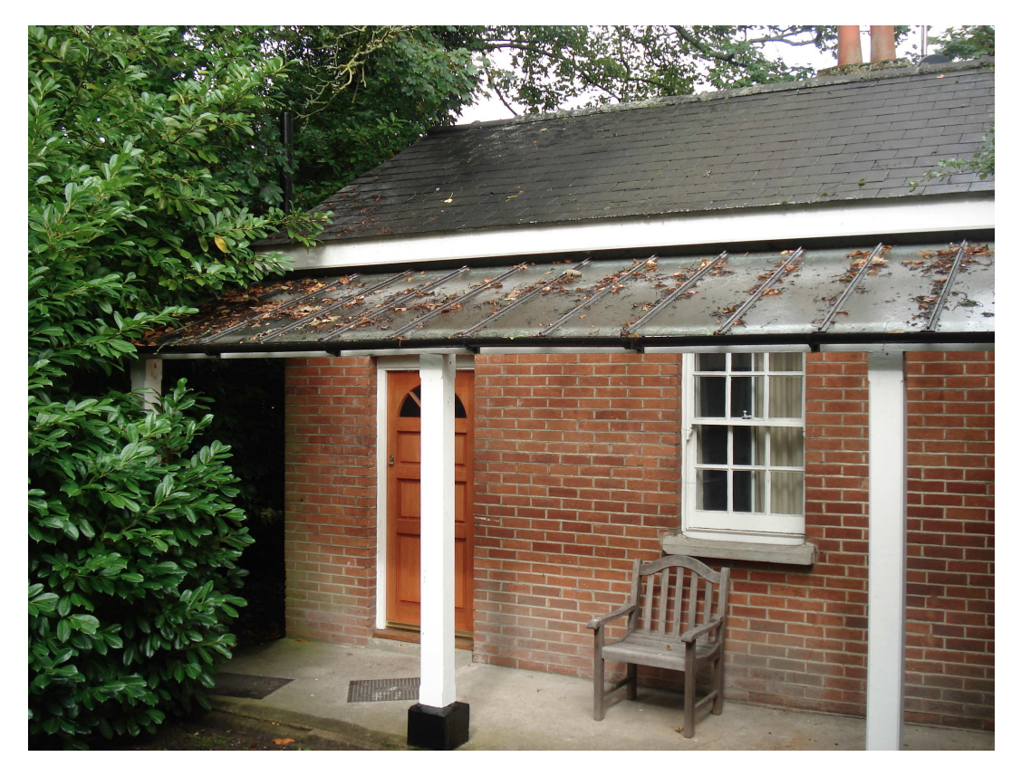
Guardhouse at Government House, Farnborough Road, Aldershot – south elevation (part)