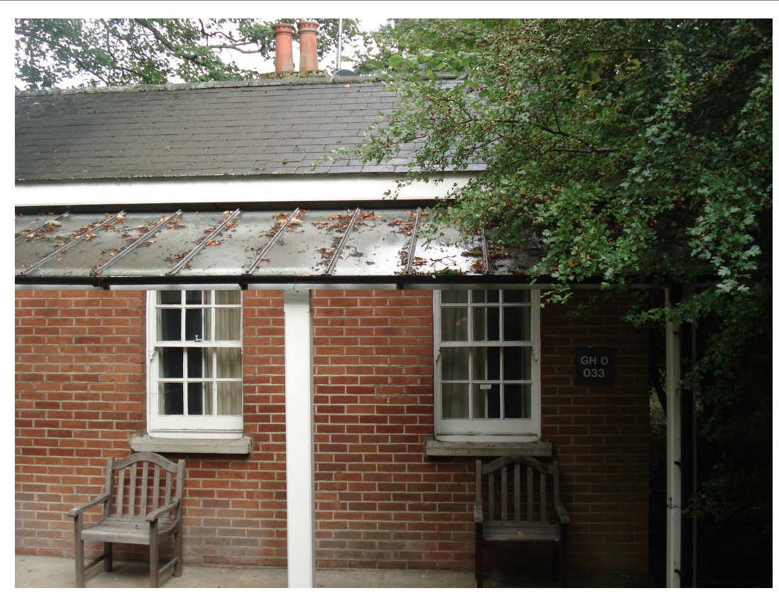
Guardhouse at Government House, Farnborough Road, Aldershot – south elevation (part)