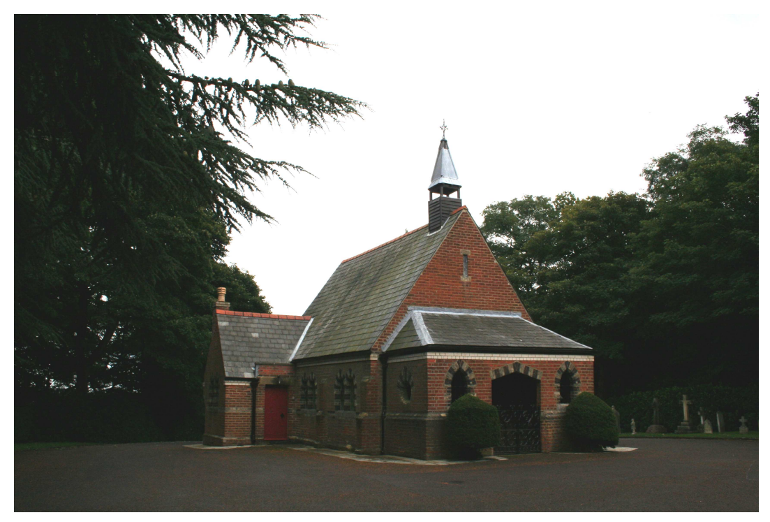
Mortuary Chapel at Aldershot Military Cemetery, Gallwey Road, Aldershot – west and north elevations