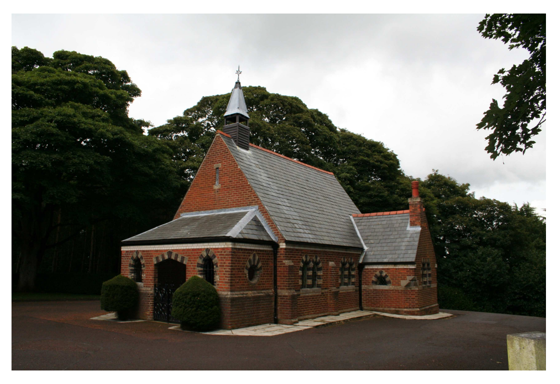
Mortuary Chapel at Aldershot Military Cemetery, Gallwey Road, Aldershot – west and south elevations