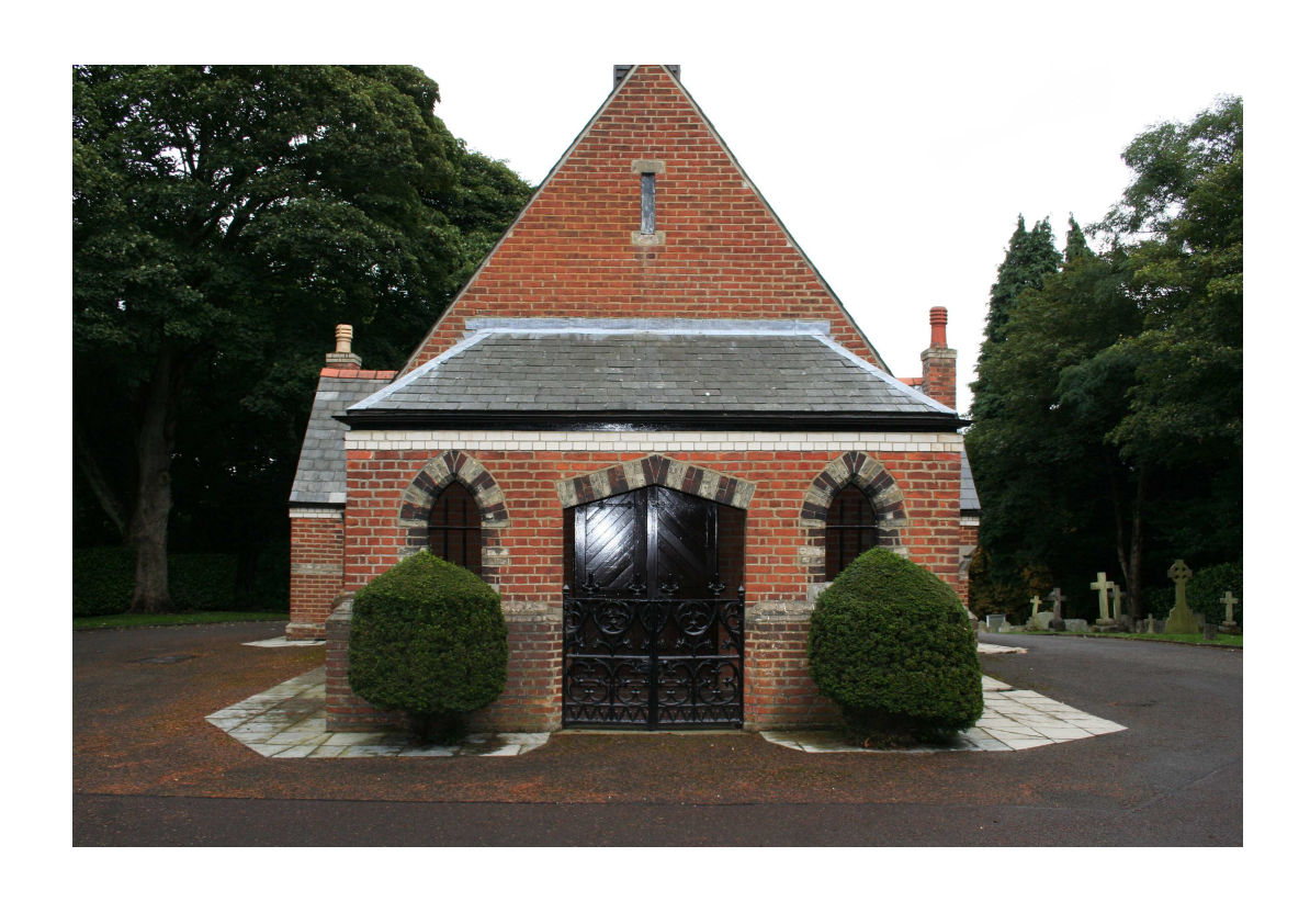
MortuaryChapel at Aldershot Military Cemetery, Gallwey Road, Aldershot – west elevation