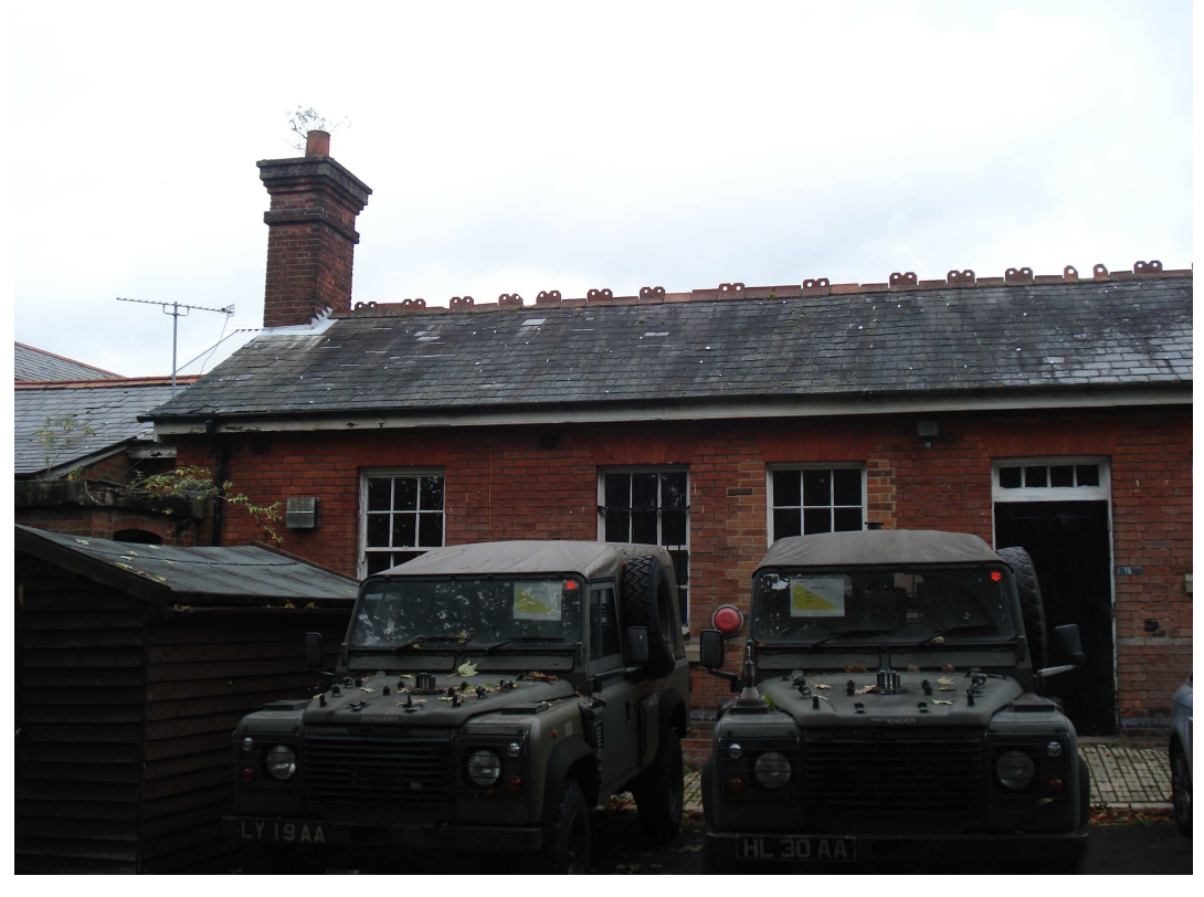
Outbuilding (probably formerly accommodation), part of a group of outbuildings to north and north-west of Fitzwygram House, Gallwey Road, Aldershot – south-west elevation