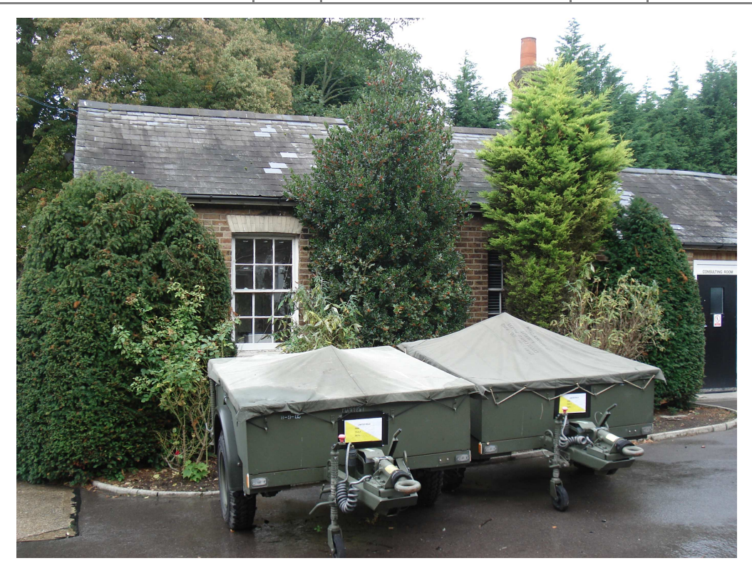
Vaccine Institute, part of a group of outbuildings to north and north-west of Fitzwygram House, Gallwey Road, Aldershot – south elevation (part)