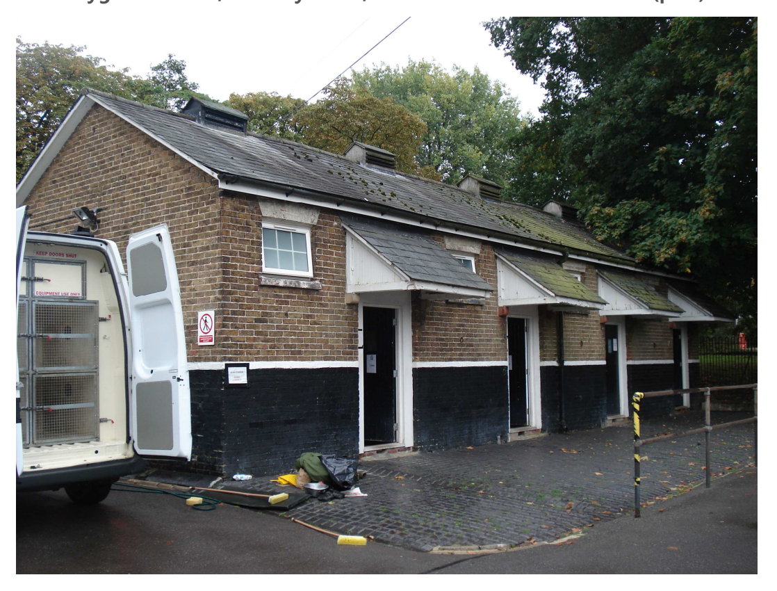
Small stable, part of a group of outbuildings to north and north-west of Fitzwygram House, Gallwey Road, Aldershot – east elevation