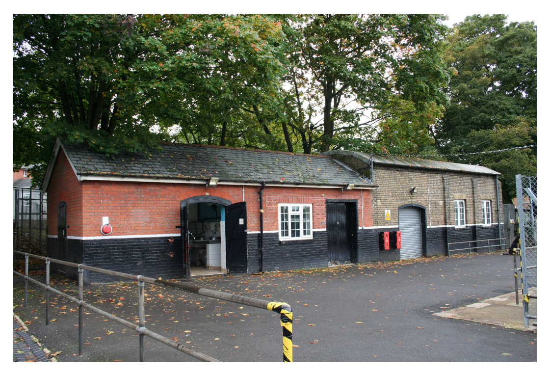
Former Forage and Shoeing shed, part of a group of outbuildings to north and northwest of Fitzwygram House, Gallwey Road, Aldershot – north elevation