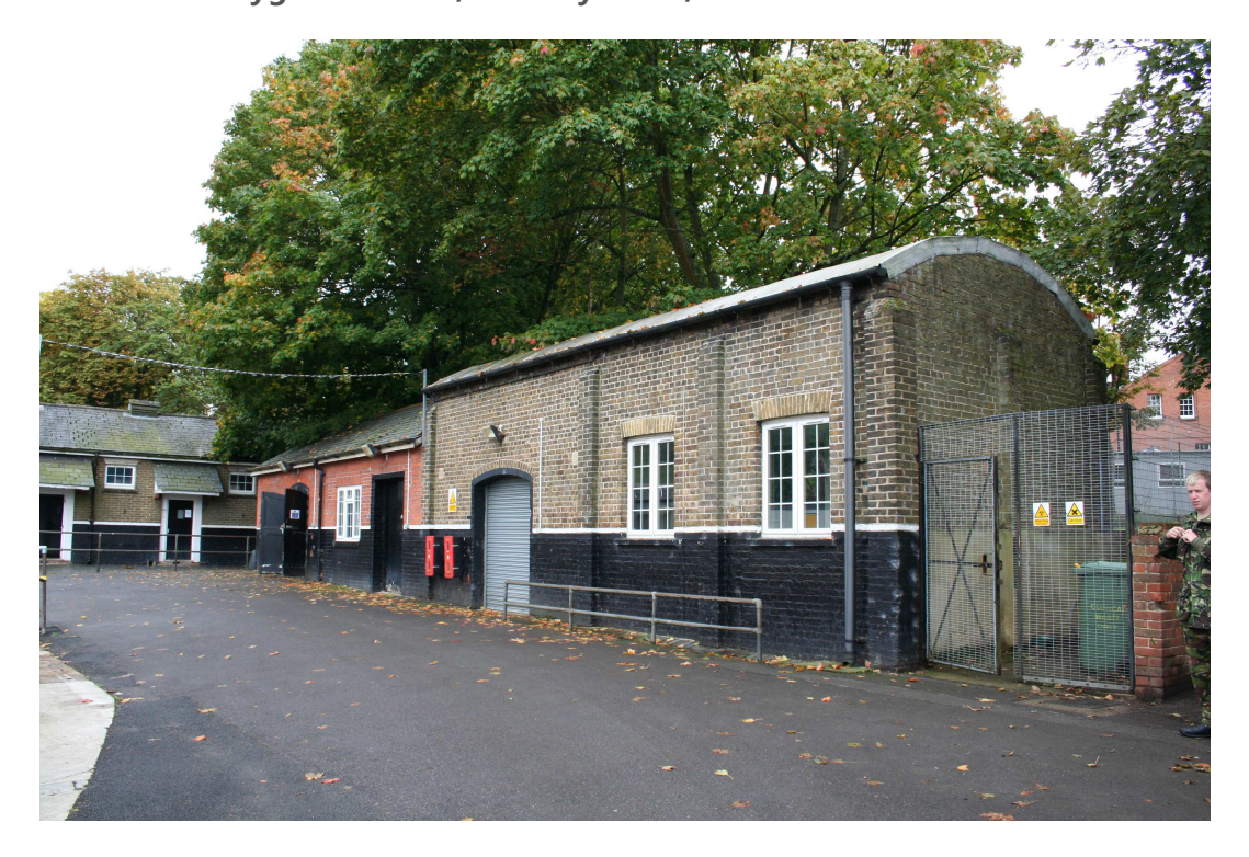
Former Forage and Shoeing shed, part of a group of outbuildings to north and northwest of Fitzwygram House, Gallwey Road, Aldershot – north elevation