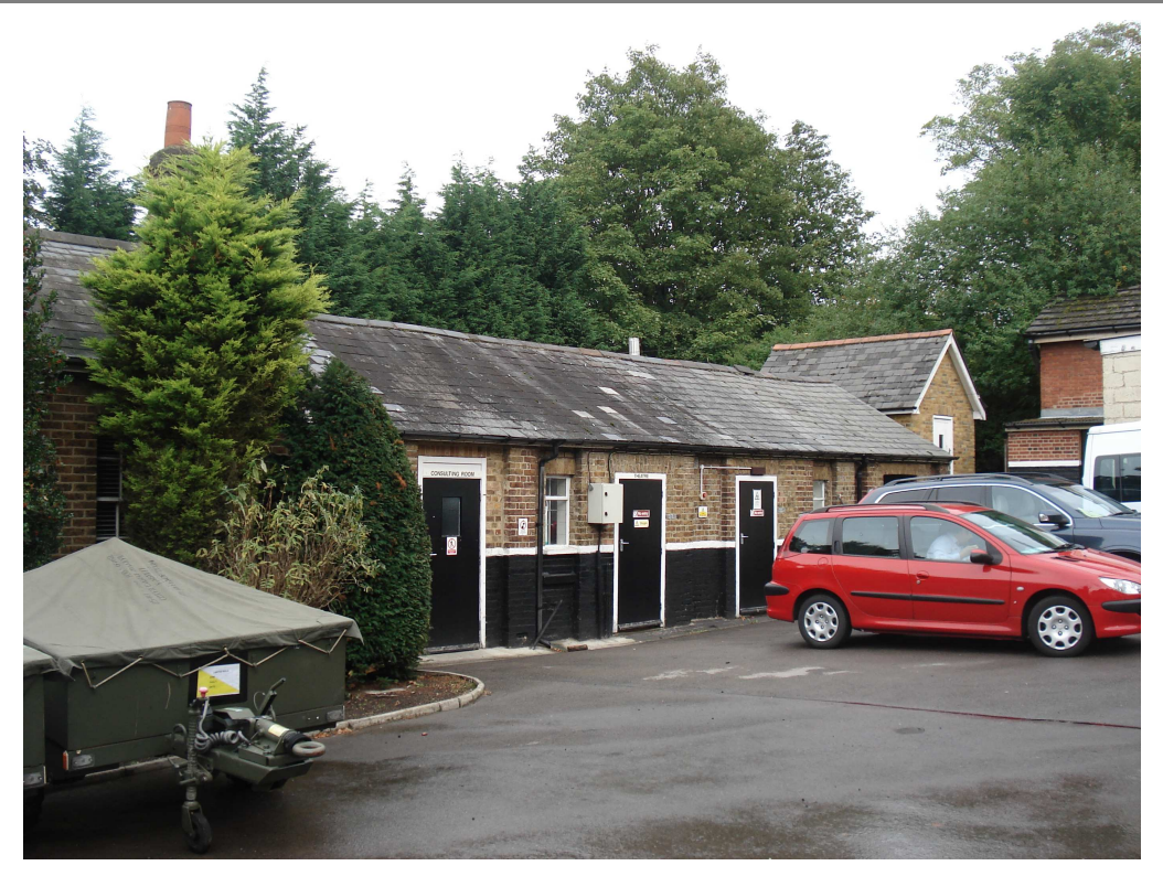
Vaccine Institute, part of a group of outbuildings to north and north-west of Fitzwygram House, Gallwey Road, Aldershot – south elevation