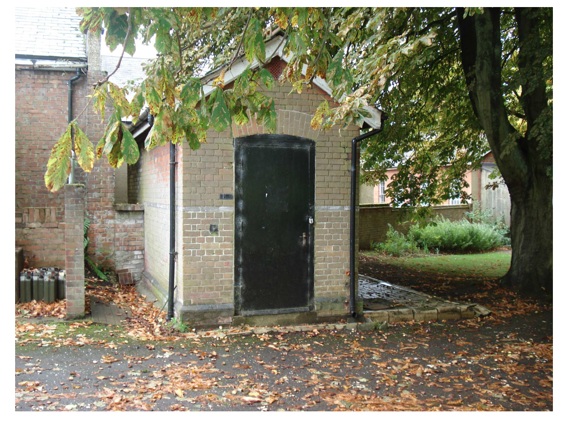
Outbuilding (possibly dressing or disinfecting shed), part of a group of outbuildings to north and north-west of Fitzwygram House, Gallwey Road, Aldershot