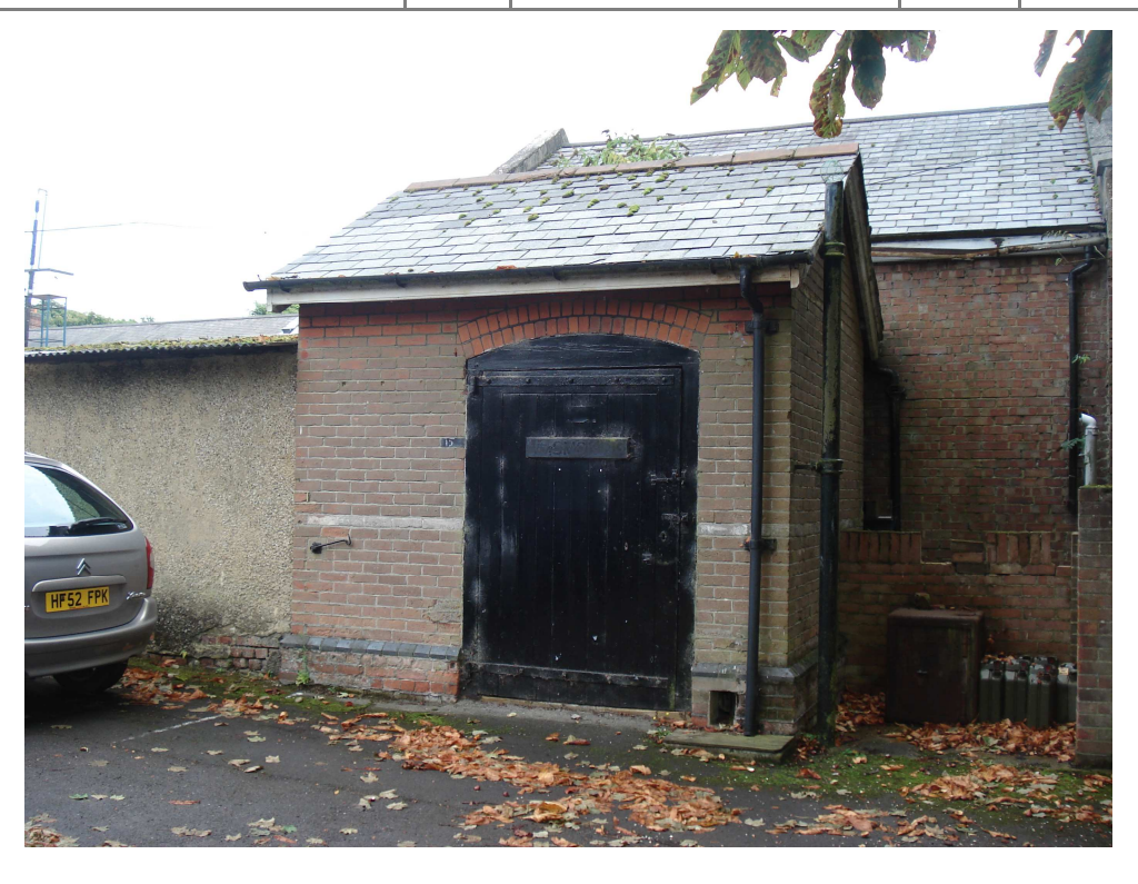
Outbuilding (possibly dressing or disinfecting shed), part of a group of outbuildings to north and north-west of Fitzwygram House, Gallwey Road, Aldershot