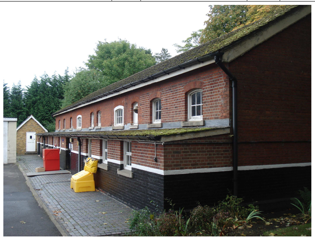
Large stable, part of a group of outbuildings to north and north-west of Fitzwygram House, Gallwey Road, Aldershot – west elevation