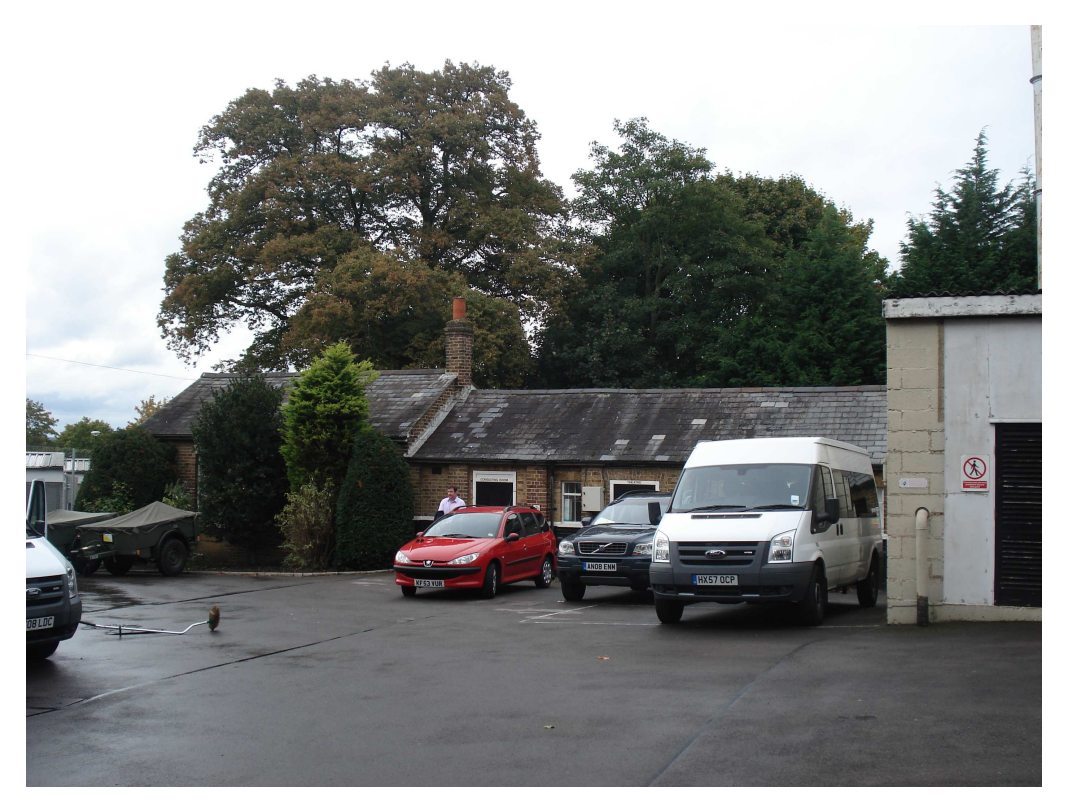
Vaccine Institute, part of a group of outbuildings to north and north-west of Fitzwygram House, Gallwey Road, Aldershot – south elevation