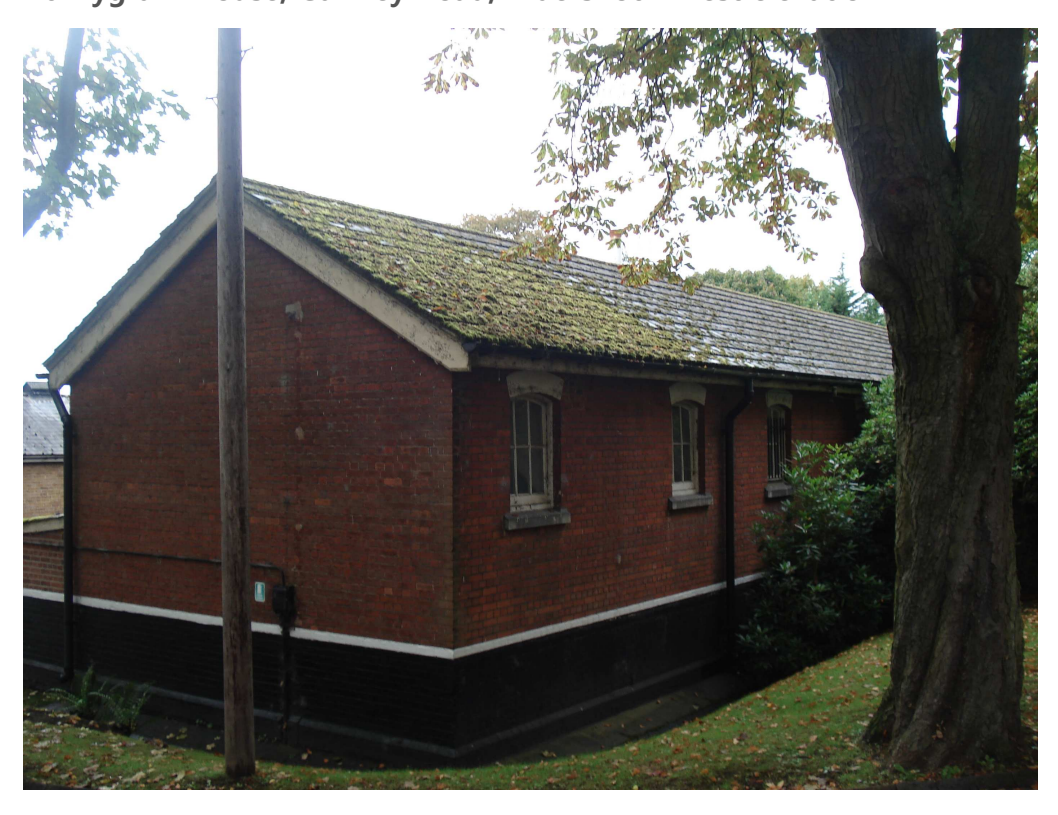
Large stable, part of a group of outbuildings to north and north-west of Fitzwygram House, Gallwey Road, Aldershot – south and part east elevation