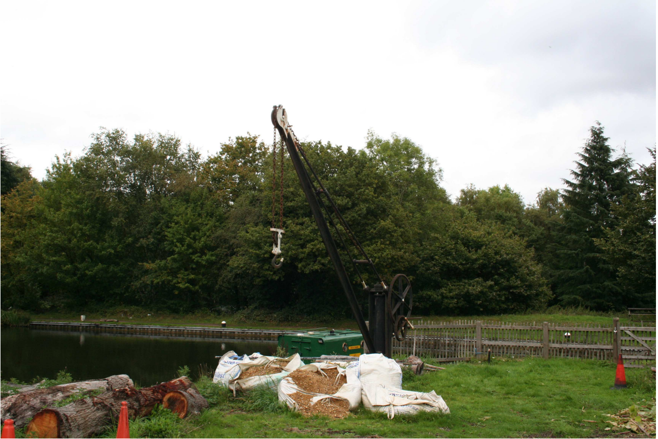
Crane at Ash Lock, Government Road, Aldershot