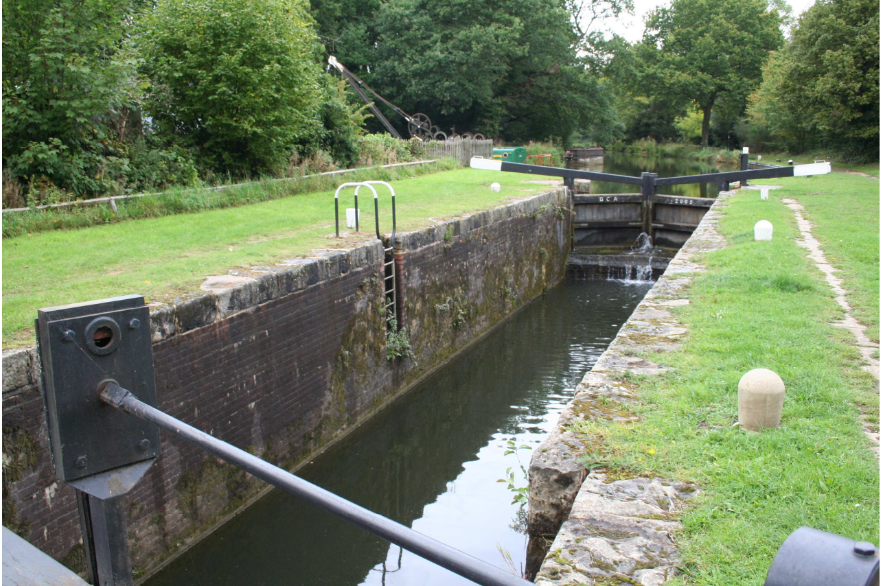
Ash Lock, Government Road, Aldershot