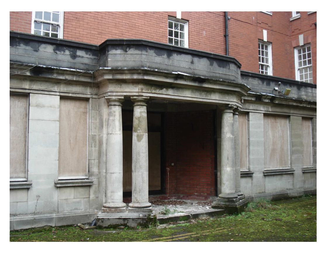
Gun Hill House, Gun Hill, Aldershot – west elevation (entrance)