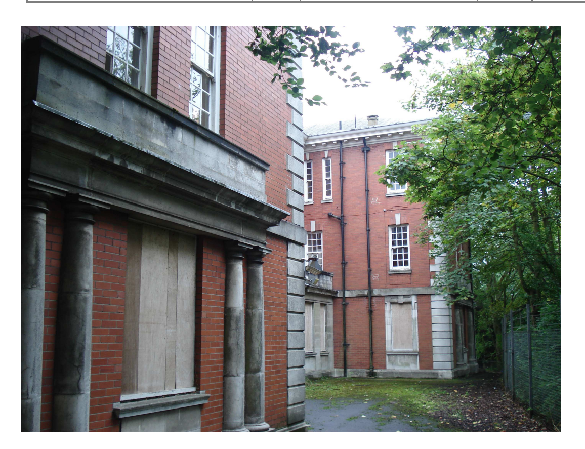
Gun Hill House, Gun Hill, Aldershot – west elevation (courtyard)