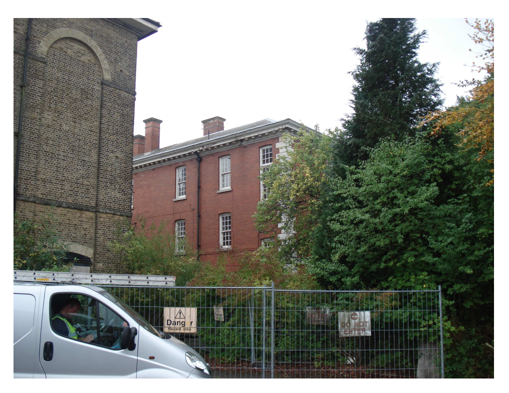
Gun Hill House, Gun Hill, Aldershot – part of east elevation