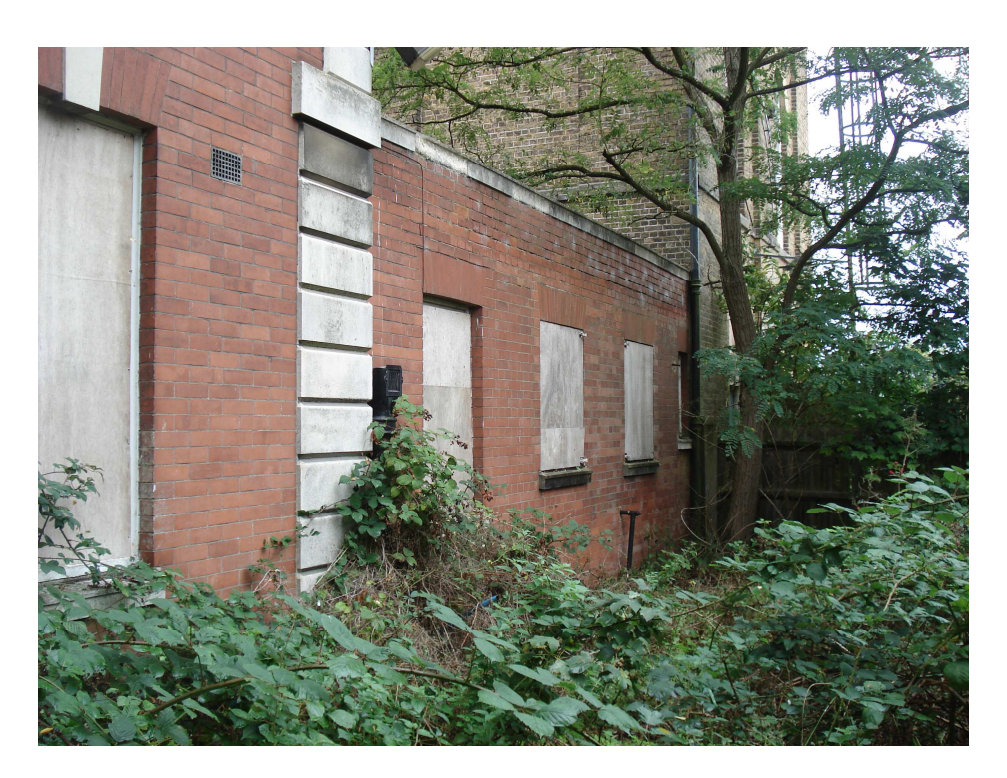
Gun Hill House, Gun Hill, Aldershot – south elevation (part)