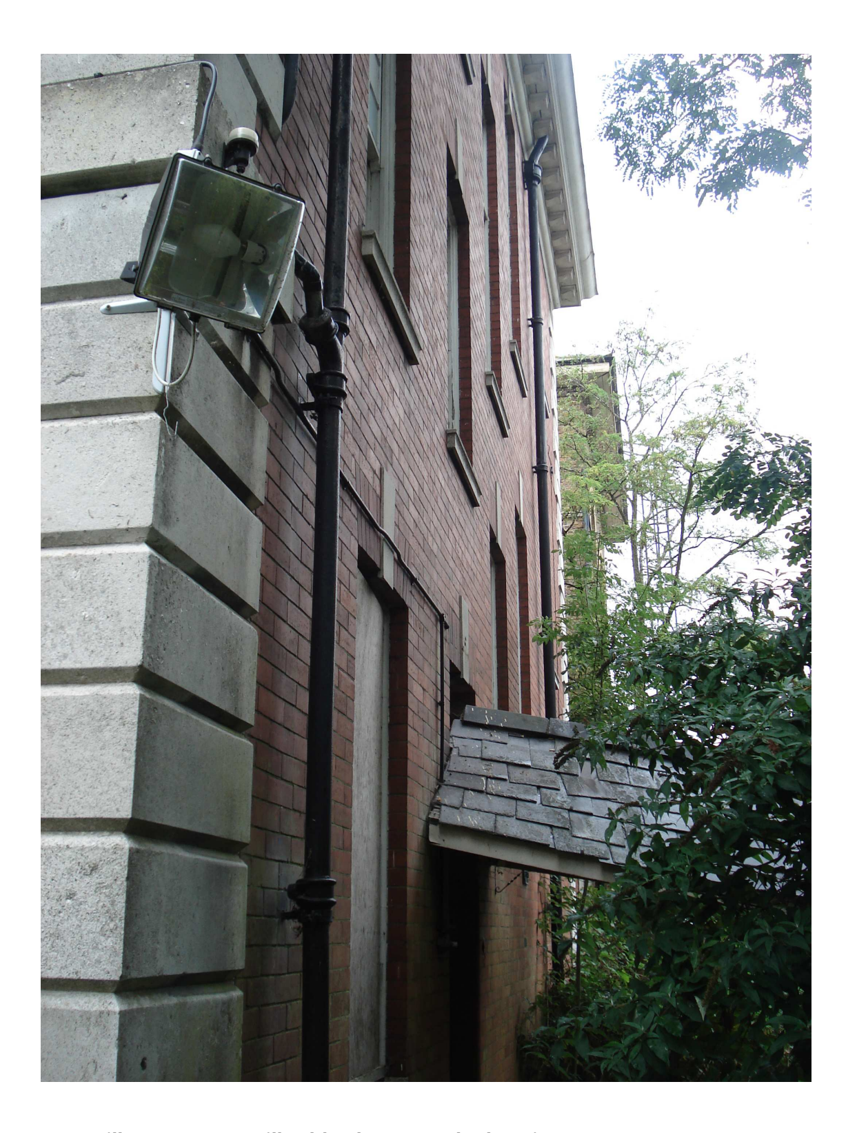
Gun Hill House, Gun Hill, Aldershot – south elevation