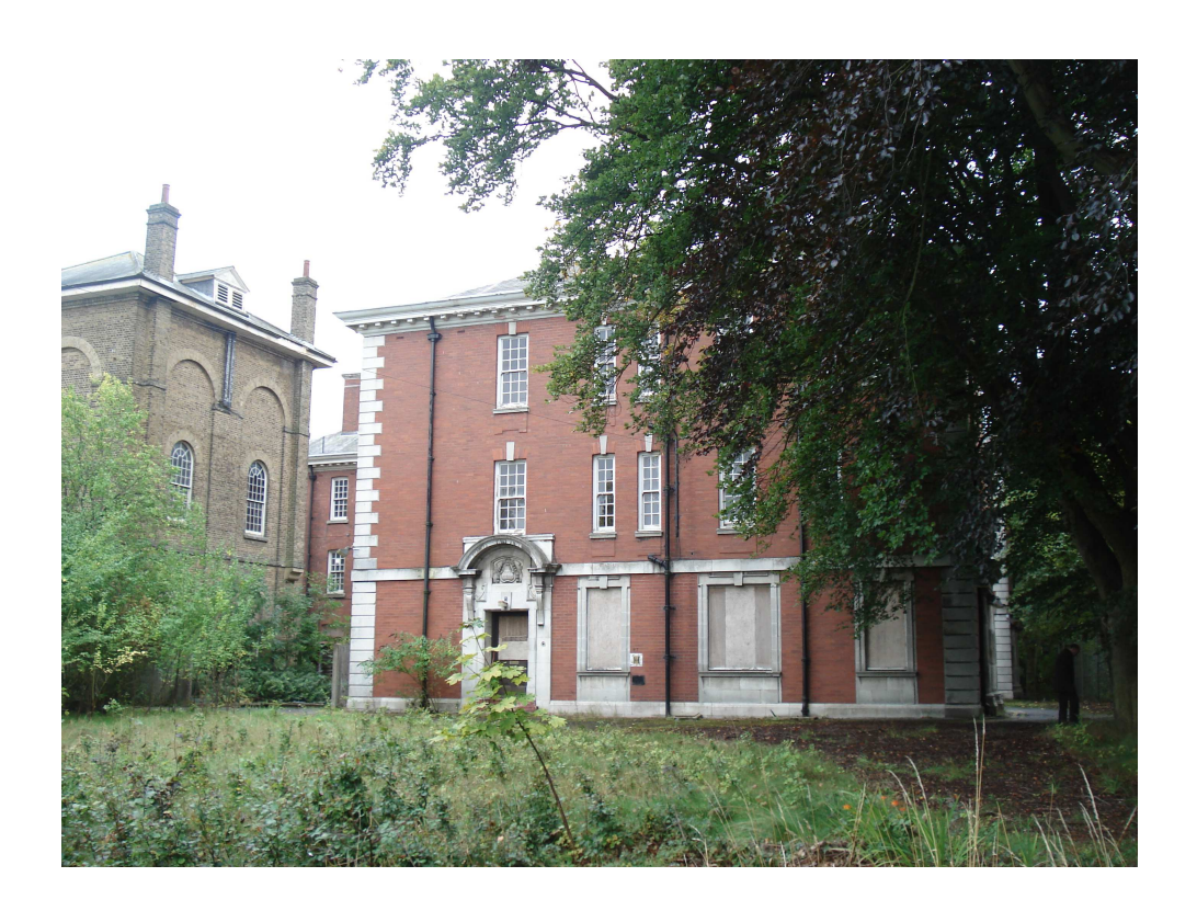
G un Hill House, Gun Hill, Aldershot - north elevation