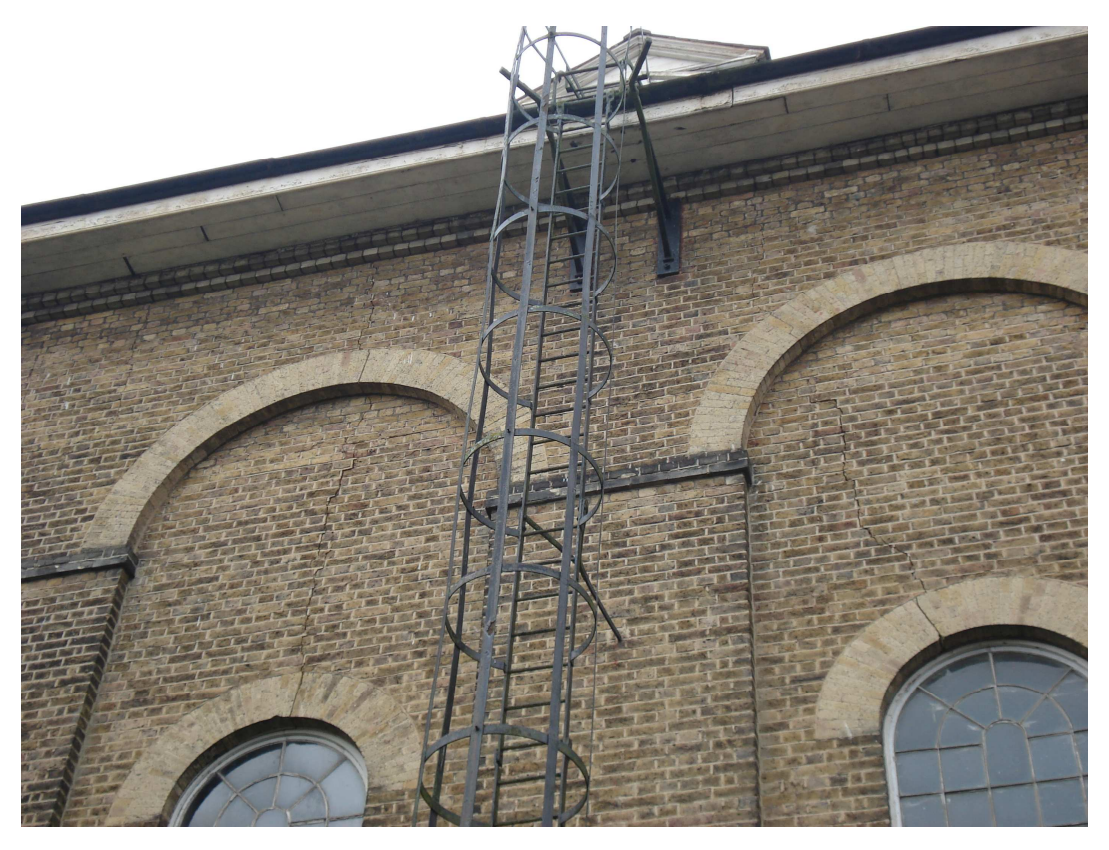
Water Tower, Hospital Road (to West of Cambridge Military Hospital main block), Aldershot - east elevation (detail)