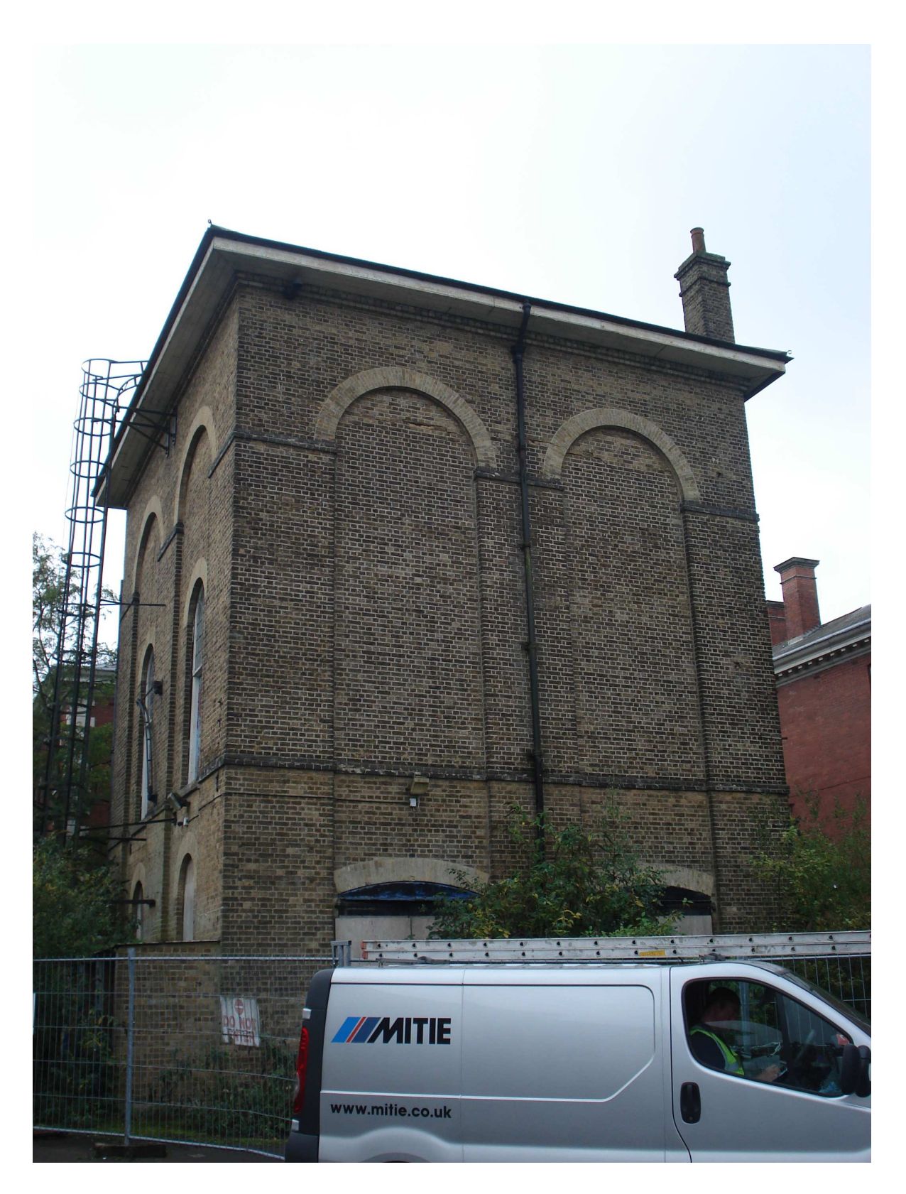
Water Tower, Hospital Road (to West of Cambridge Military Hospital main block), Aldershot - north elevation