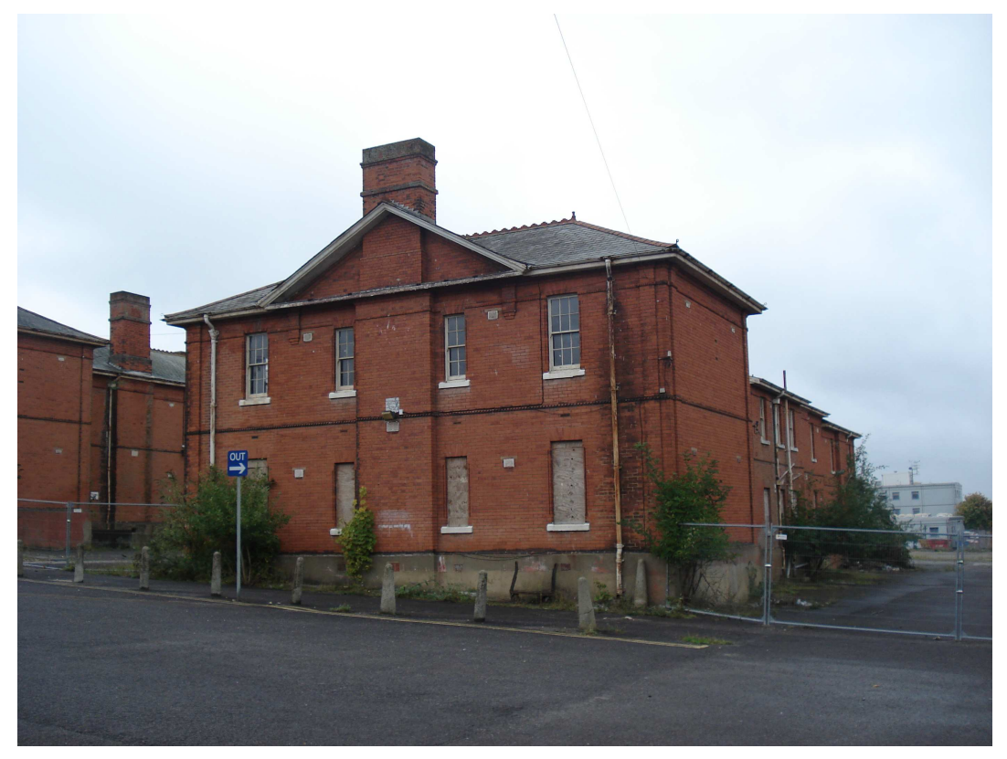
McGrigor Barracks, Hospital Road (North side), Aldershot – C Block (east elevation)