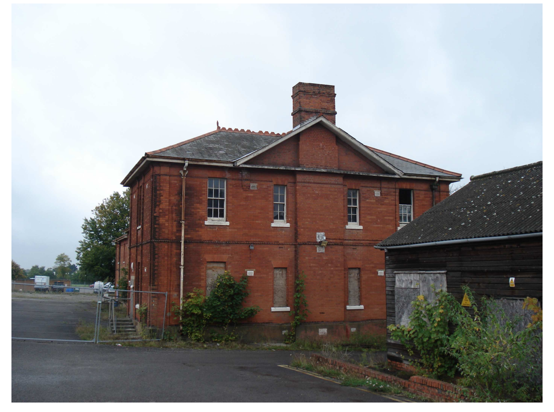
McGrigor Barracks, Hospital Road (North side), Aldershot – D Block (east elevation)