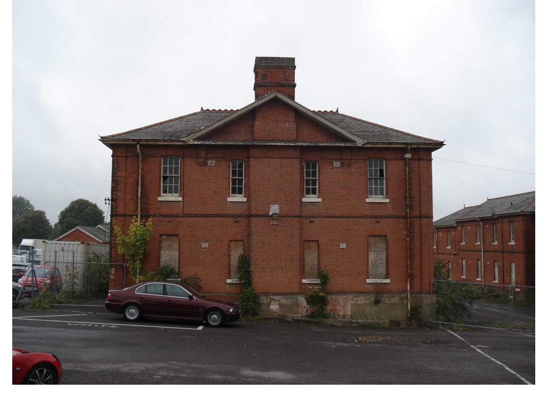
McGrigor Barracks, Hospital Road (North side), Aldershot – B Block east elevation