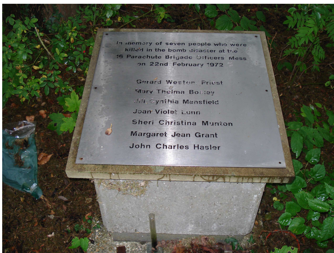
Memorial to IRA victims, Pennefathers Avenue, Aldershot