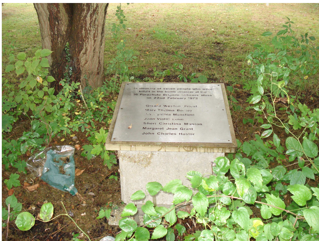
Memorial to IRA victims, Pennefathers Avenue, Aldershot