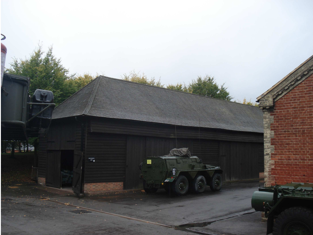
Montgomery's barn to South of Aldershot Military Museum, Evelyn Woods Road, Aldershot – north and east elevations