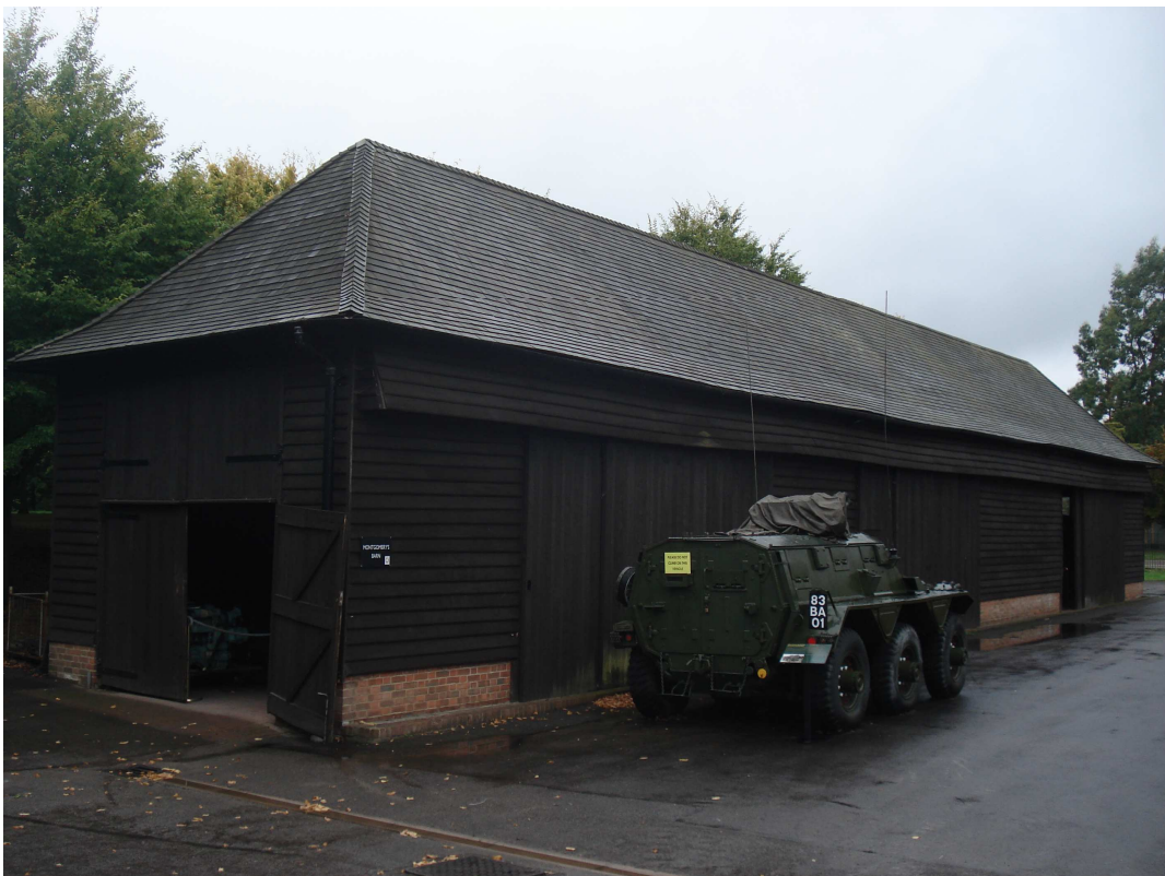
Montgomery's barn to South of Aldershot Military Museum, Evelyn Woods Road, Aldershot – north and east elevations