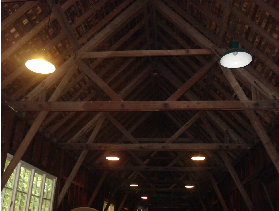
Montgomery's barn to South of Aldershot Military Museum, Evelyn Woods Road, Aldershot – internal view – roof detail