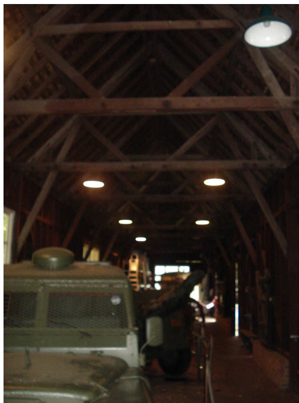
Montgomery's barn to South of Aldershot Military Museum, Evelyn Woods Road, Aldershot – internal view – general shot