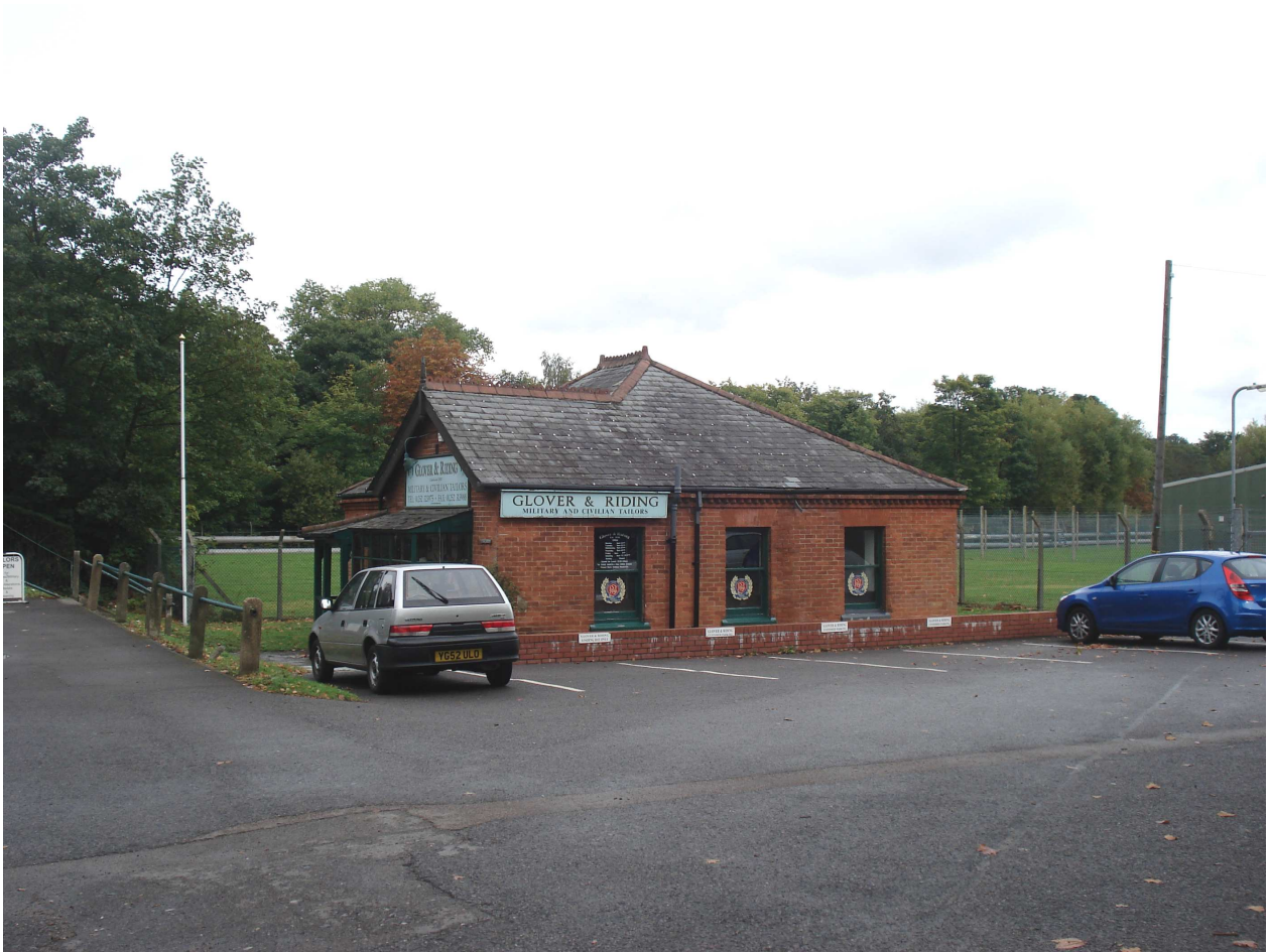
Glover and Riding, Queens Avenue, Aldershot