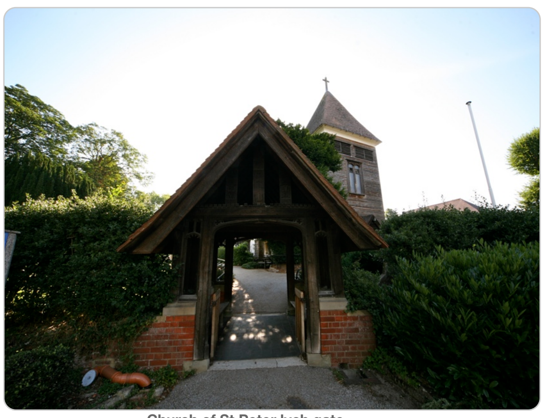
Church of St Peter lych gate Church Avenue, Farnborough