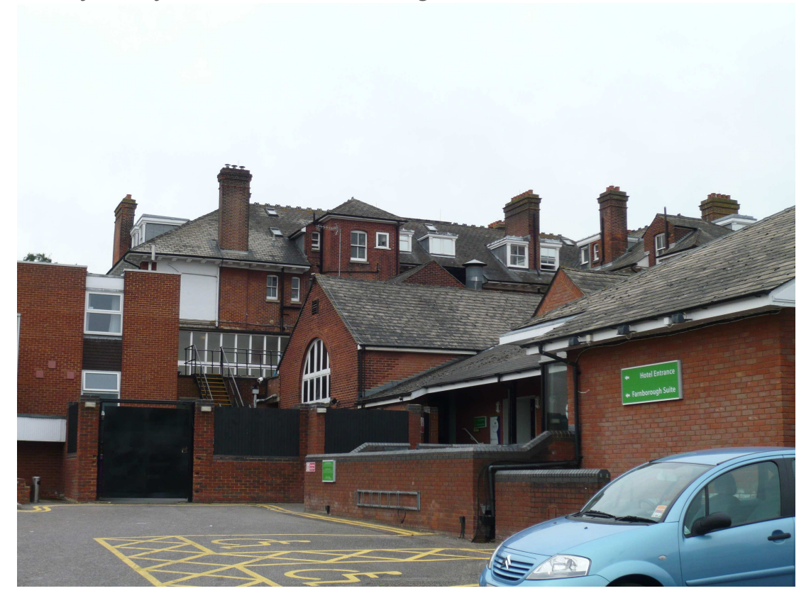
Holiday Inn, Lynchford Road, Farnborough – north elevation (part)