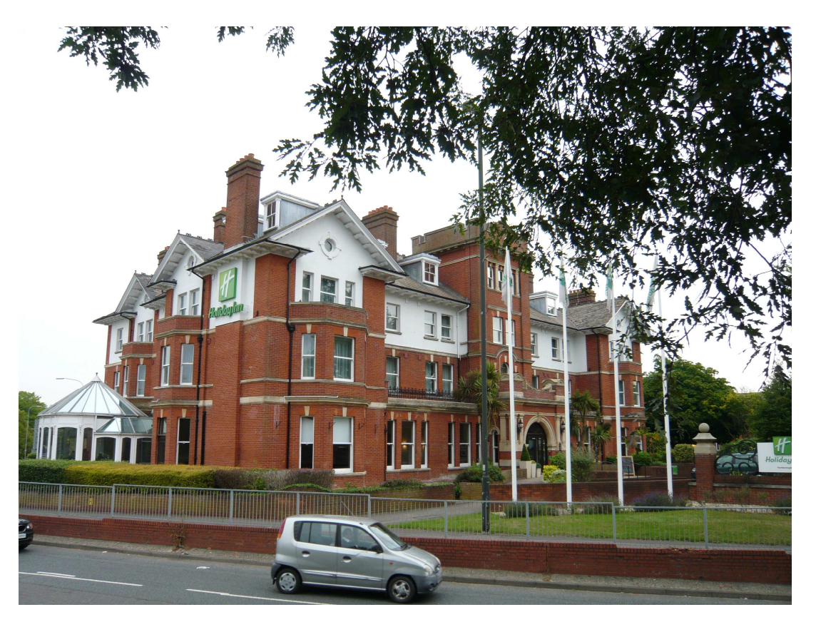
Holiday Inn, Lynchford Road, Farnborough – south and west elevations