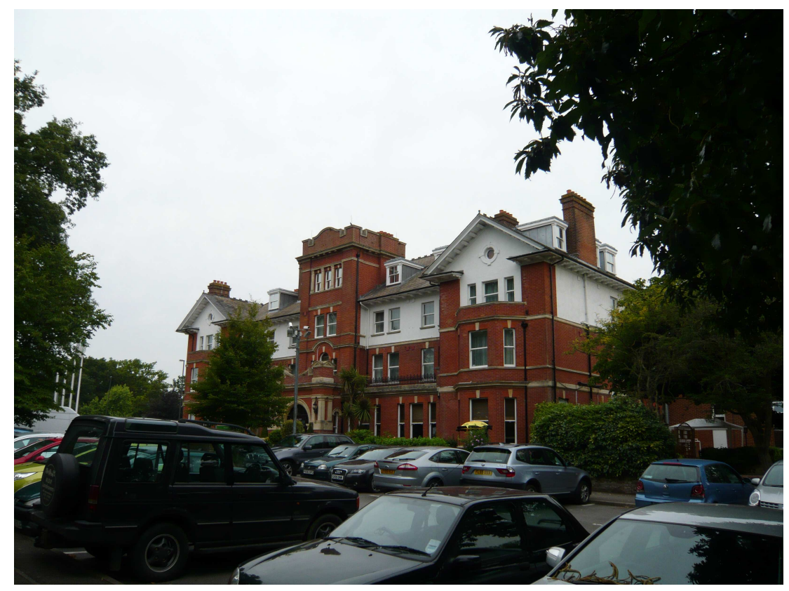
Holiday Inn, Lynchford Road, Farnborough – south elevation