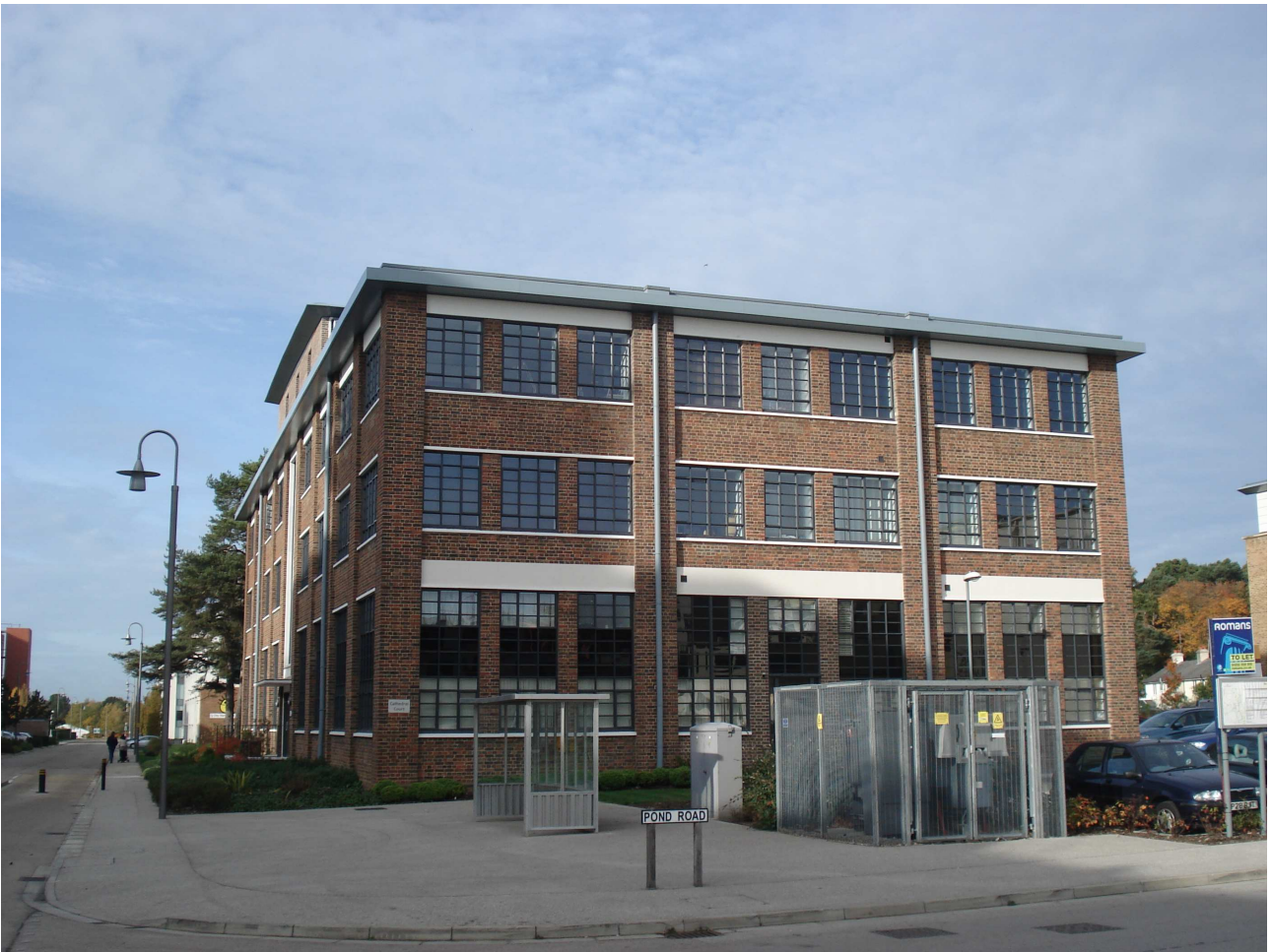
Cathedral Court, O’Gorman Avenue, Farnborough