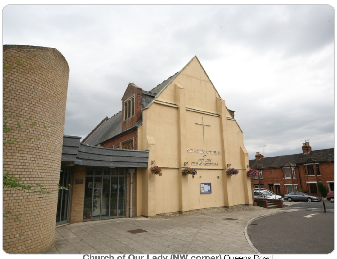
Church of Our Lady (NW corner) Queens Road,