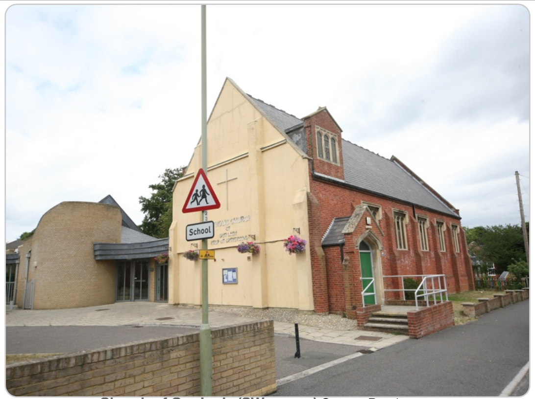
Church of Our Lady (SW corner) Queens Road, Farnborough