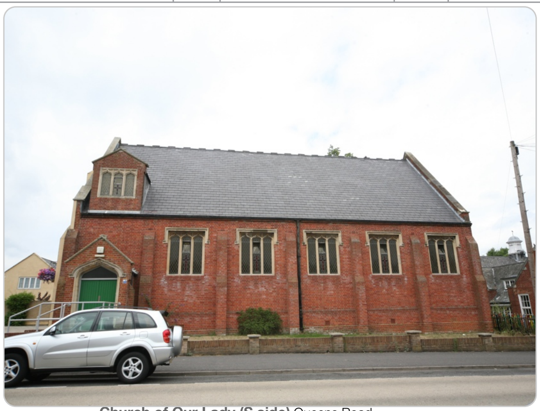
Church of Our Lady (S side) Queens Road,