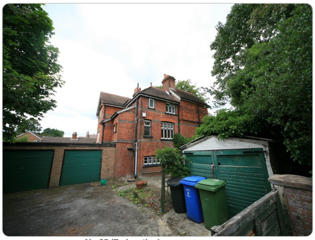
No.25 (E elevation) Reading Road, Farnborough