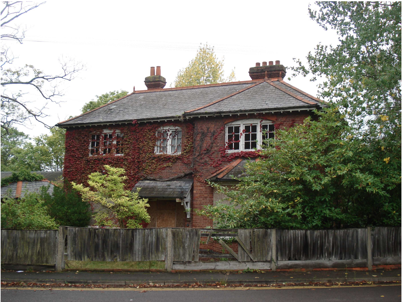
St Michael's House, Hospital Road, Farnborough – south elevation