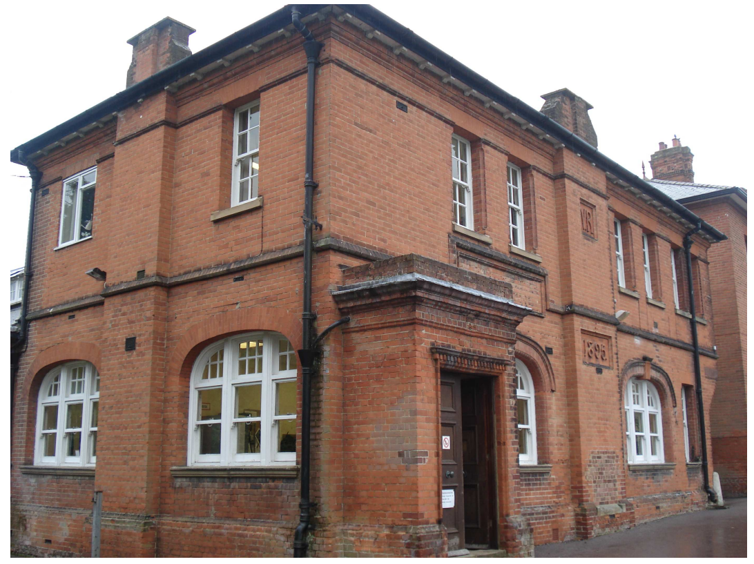
Former Post Office tHeadquarters, Steeles Road, Aldershot – west and north elevations