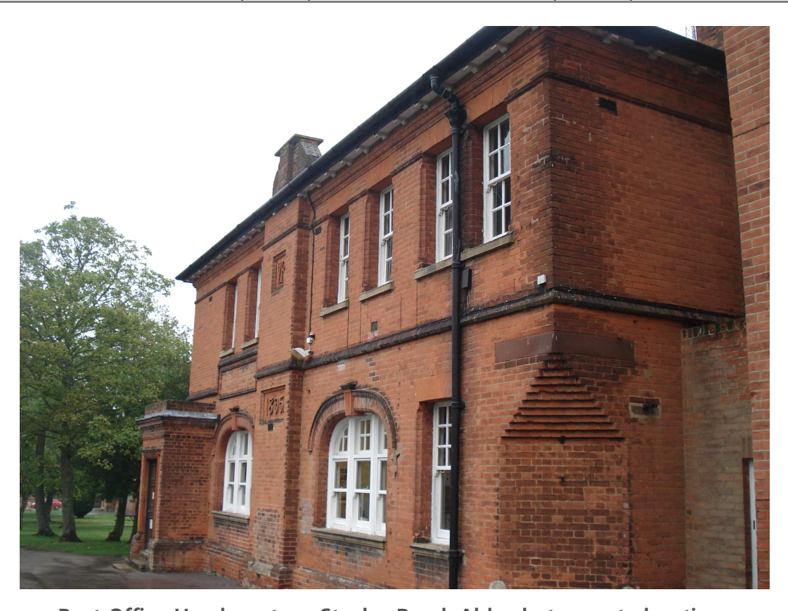
Former Post Office Headquarters, Steeles Road, Aldershot – west elevation