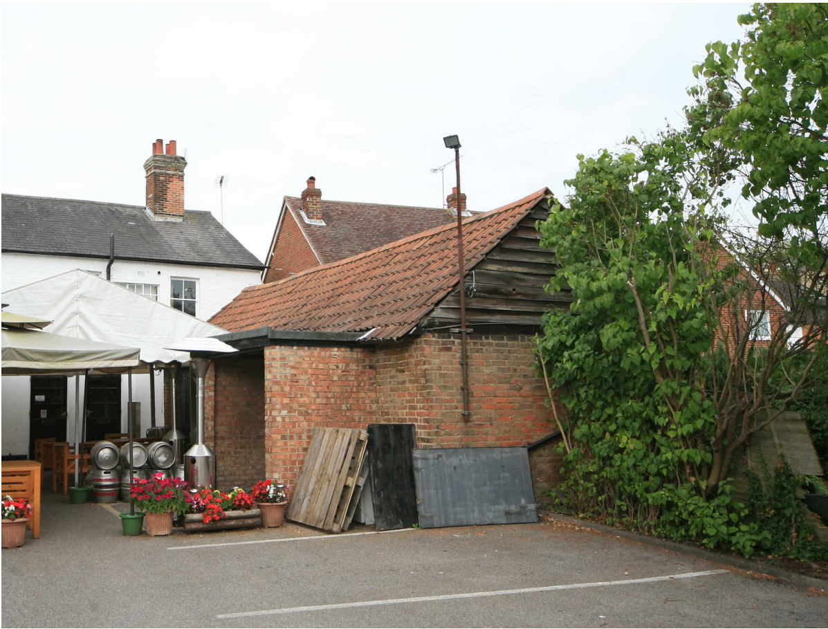
Outbuilding to rear, The Prince of Wales Public House, 184 Rectory Road, Farnborough