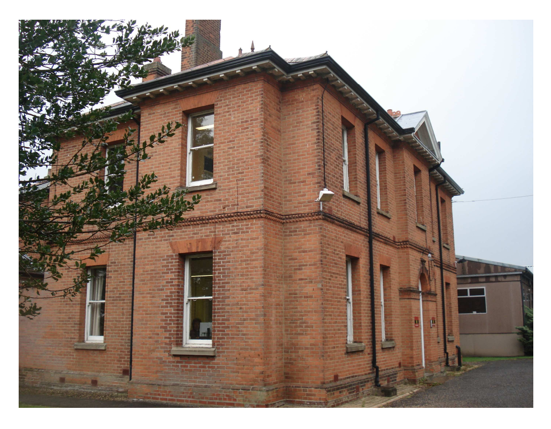
Cranbrook House, Queens Avenue, Aldershot – (part) west and south elevation