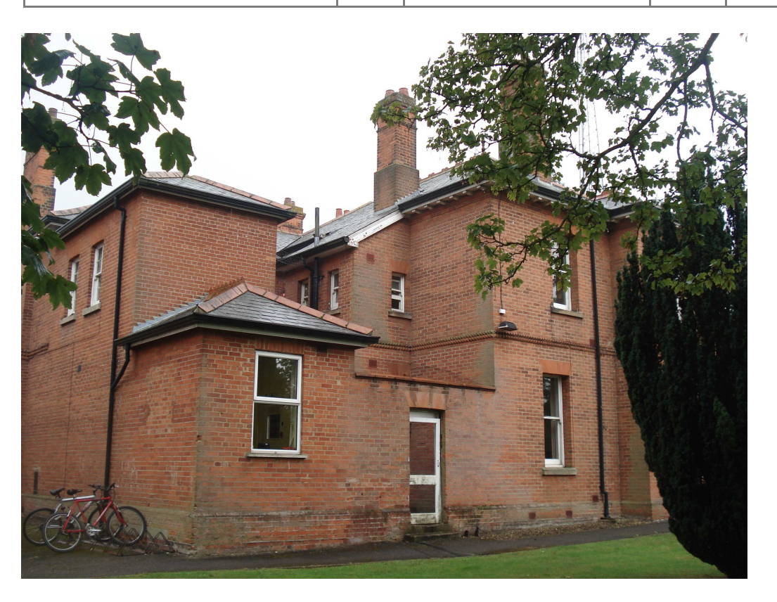
Cranbrook House, Queens Avenue, Aldershot -west elevation (part)