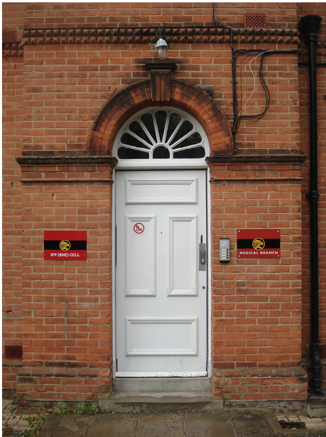
Cranbrook House, Queens Avenue, Aldershot – door detail (south elevation)