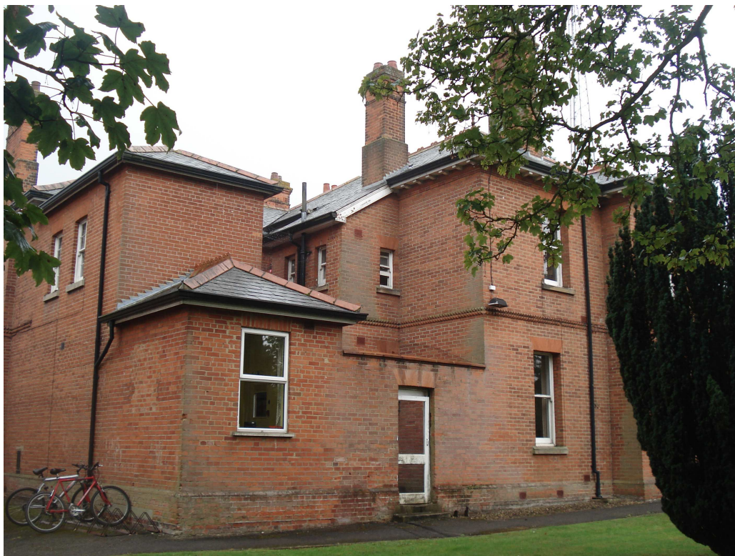
Cranbrook House, Queens Avenue, Aldershot –west elevation (part)