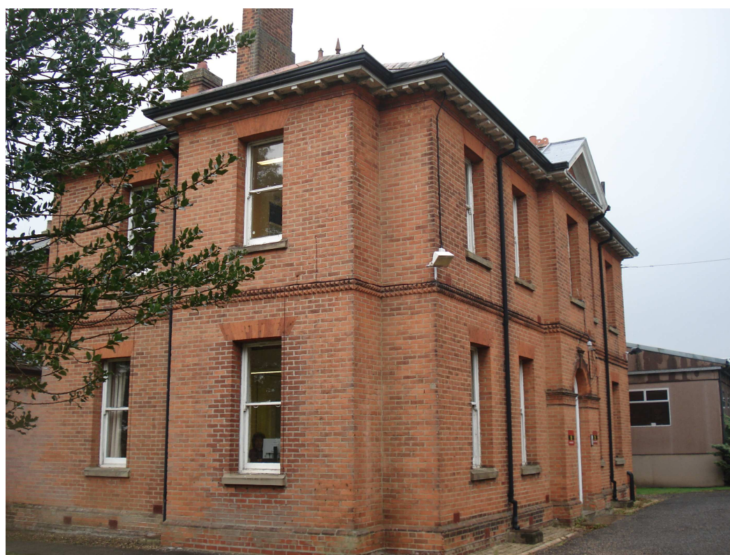
Cranbrook House, Queens Avenue, Aldershot – (part) west and south elevation