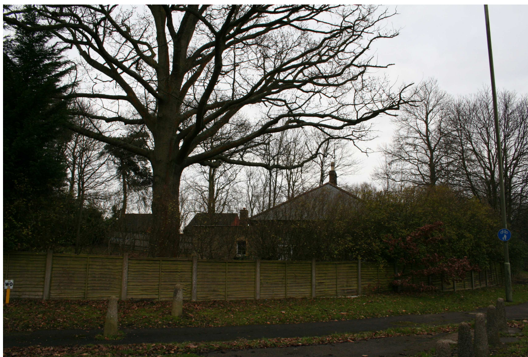
Socmanscote, Knollys Road, Aldershot – north elevation