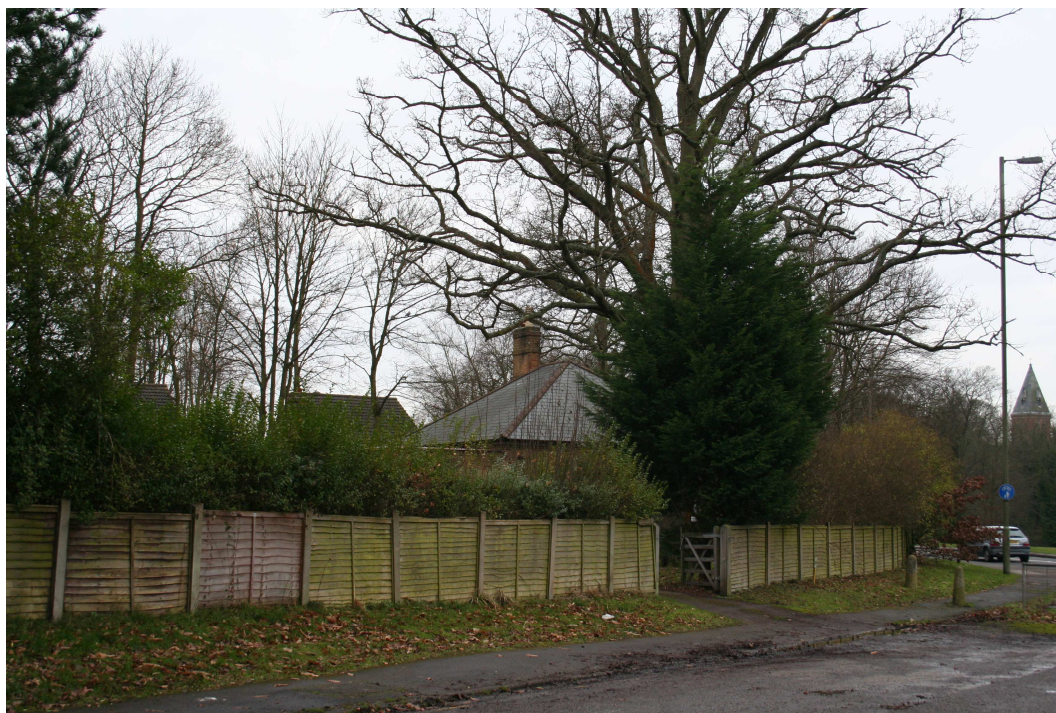
Socmanscote, Knollys Road, Aldershot - setting