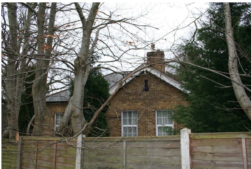
Socmanscote, Knollys Road, Aldershot – west elevation