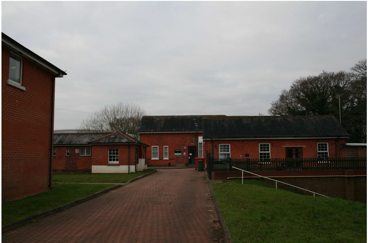
Cyprus Block, Thornhill Barracks, Gallwey Road, Aldershot