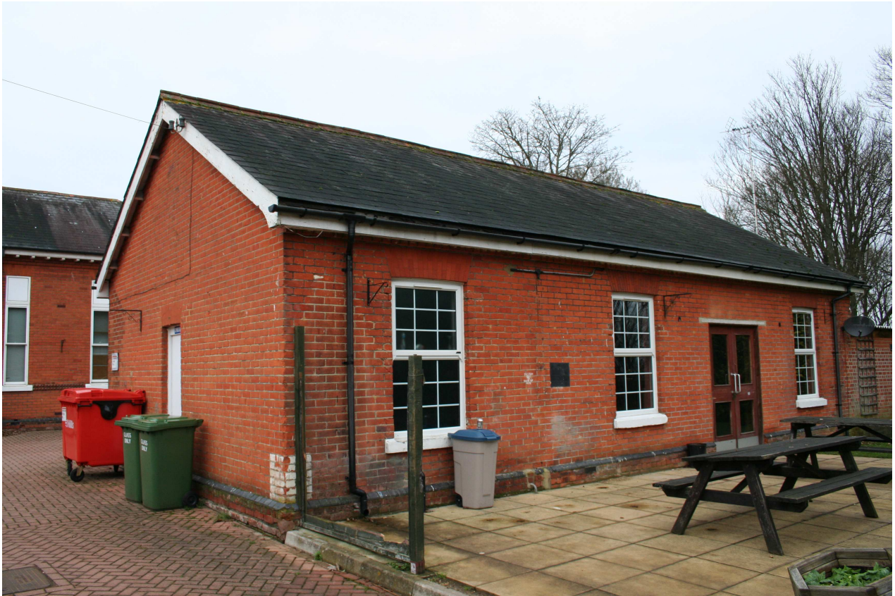
Cyprus Block, Thornhill Barracks, Gallwey Road, Aldershot