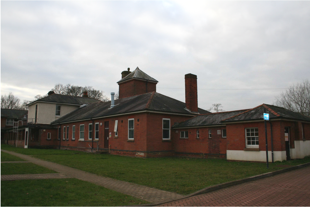
Mauritius Block, Thornhill Barracks, Gallwey Road, Aldershot – east elevation