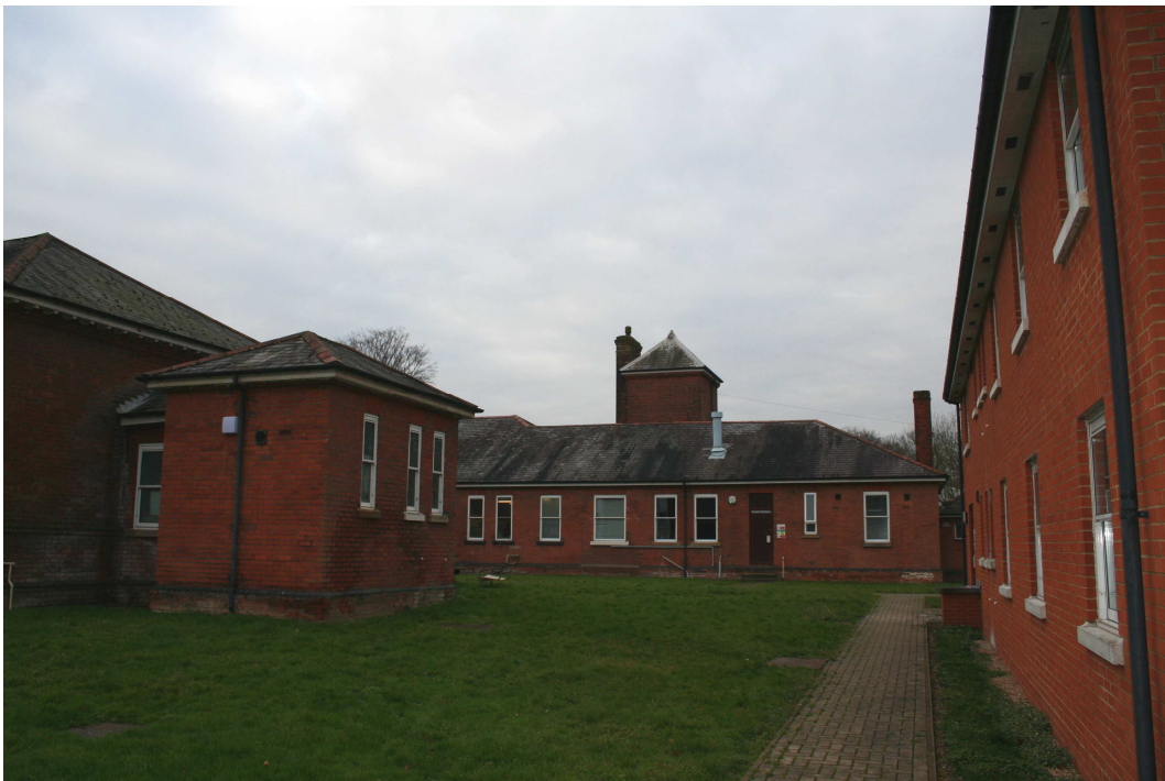
Mauritius Block, Thornhill Barracks, Gallwey Road, Aldershot – part east elevation and setting