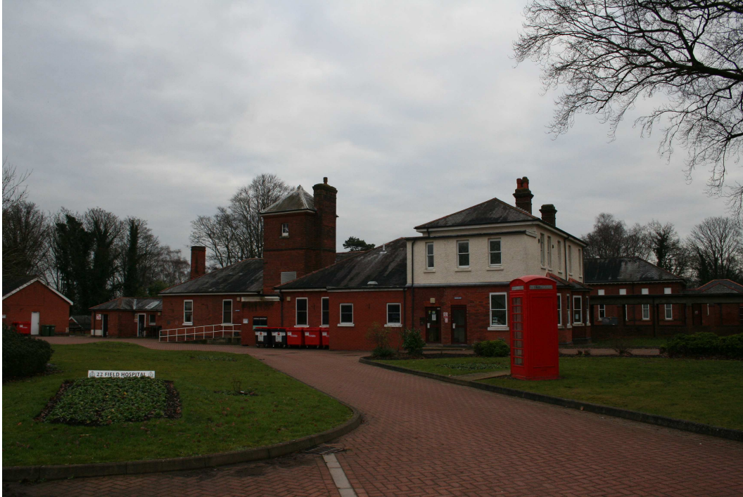
Mauritius Block, Thornhill Barracks, Gallwey Road, Aldershot – west elevation