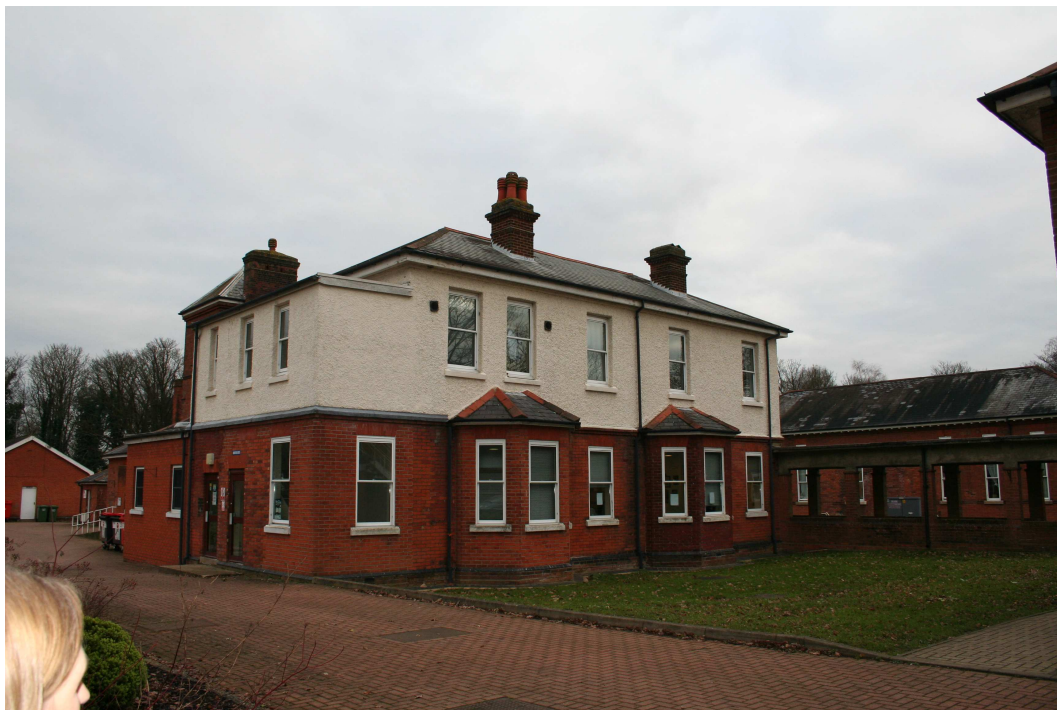
Mauritius Block, Thornhill Barracks, Gallwey Road, Aldershot – south elevation