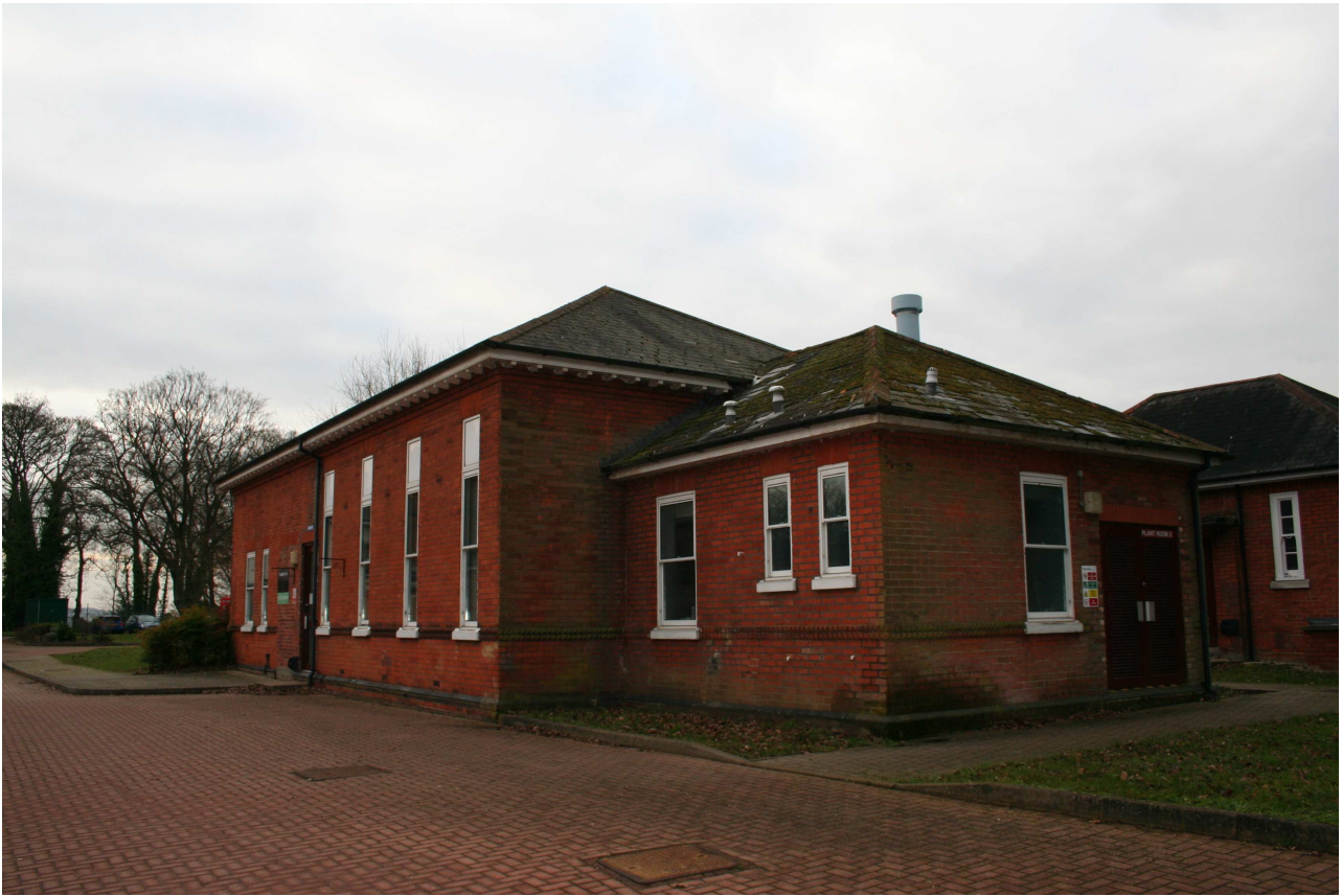
Germany Block, Thornhill Barracks, Gallwey Road, Aldershot – north and east elevations