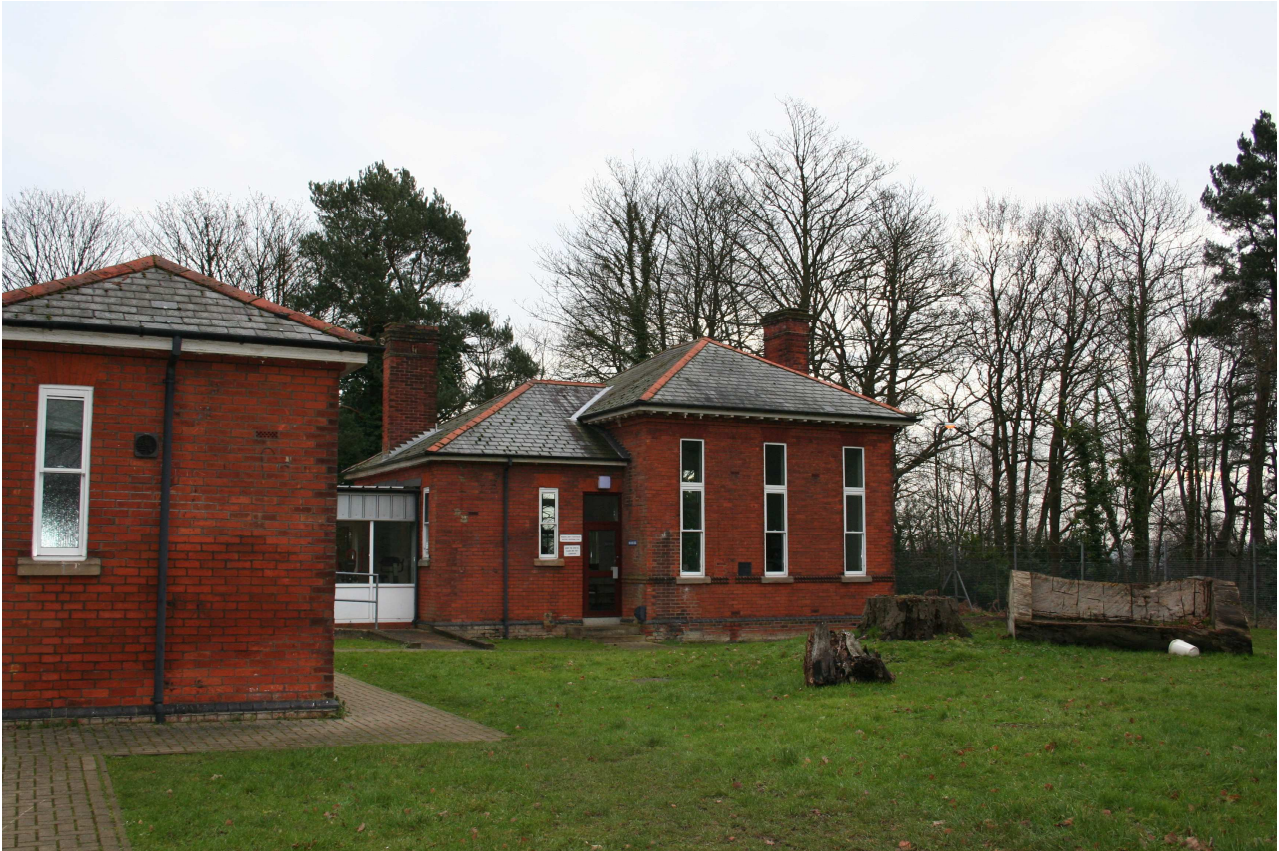
Hong Kong Block, Thornhill Barracks, Gallwey Road, Aldershot –west elevation