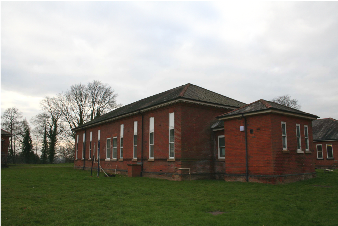
Singapore Block, Thornhill Barracks, Gallwey Road, Aldershot - east elevation