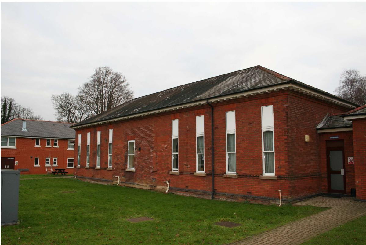
Singapore Block, Thornhill Barracks, Gallwey Road, Aldershot - west elevation