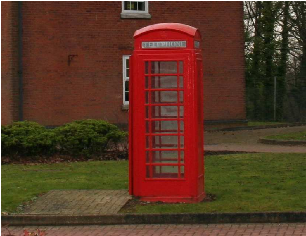
K6 Telephone Kiosk, Thornhill Barracks, Gallwey Road, Aldershot