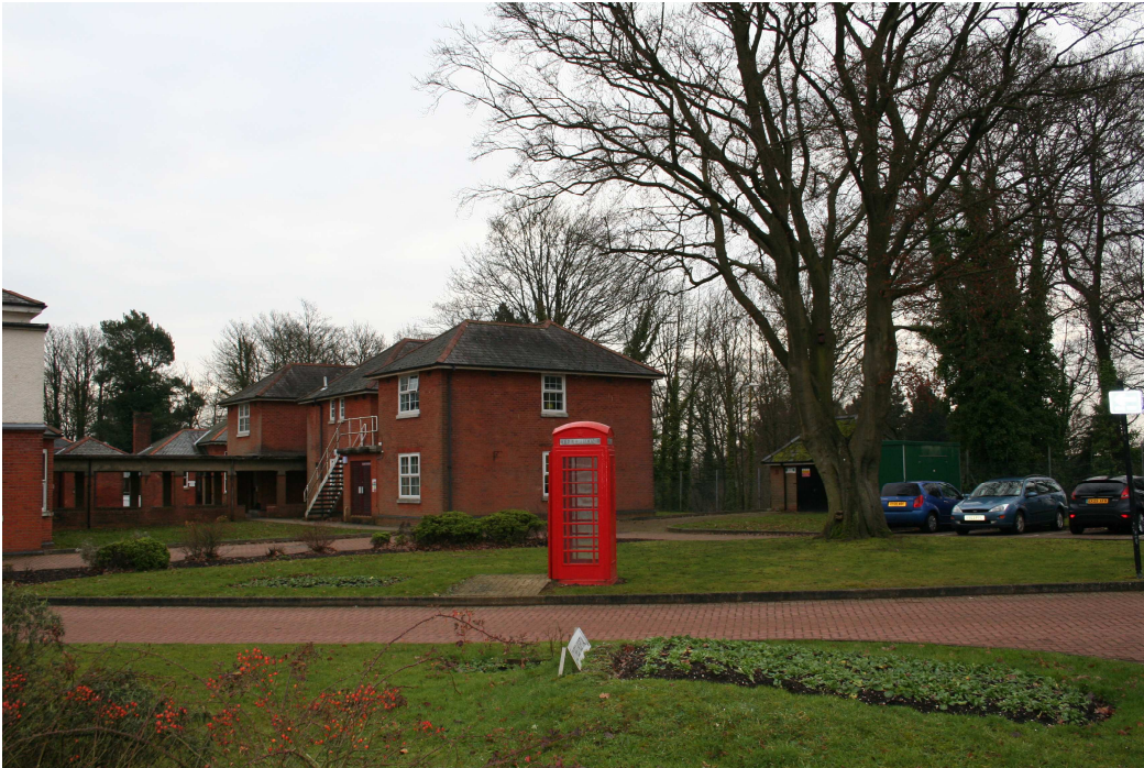
K6 Telephone Kiosk, Thornhill Barracks, Gallwey Road, Aldershot - setting