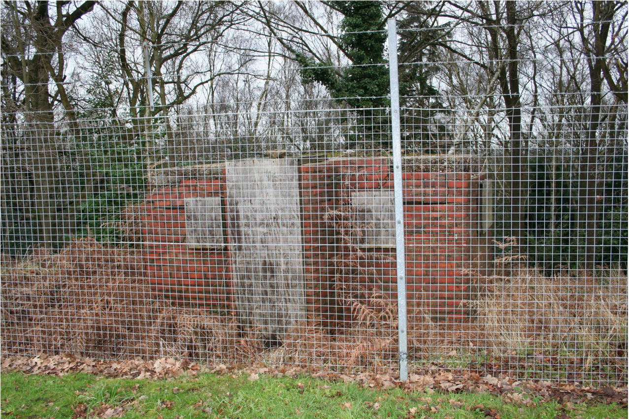
Gun Emplacement to north of Thornhill Barracks, Gallwey Road Aldershot