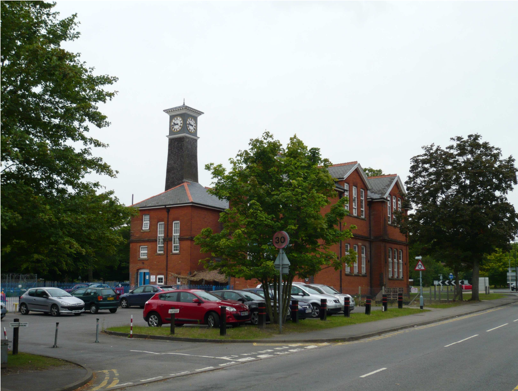
Clocktower House, Redver Buller Road – north elevation