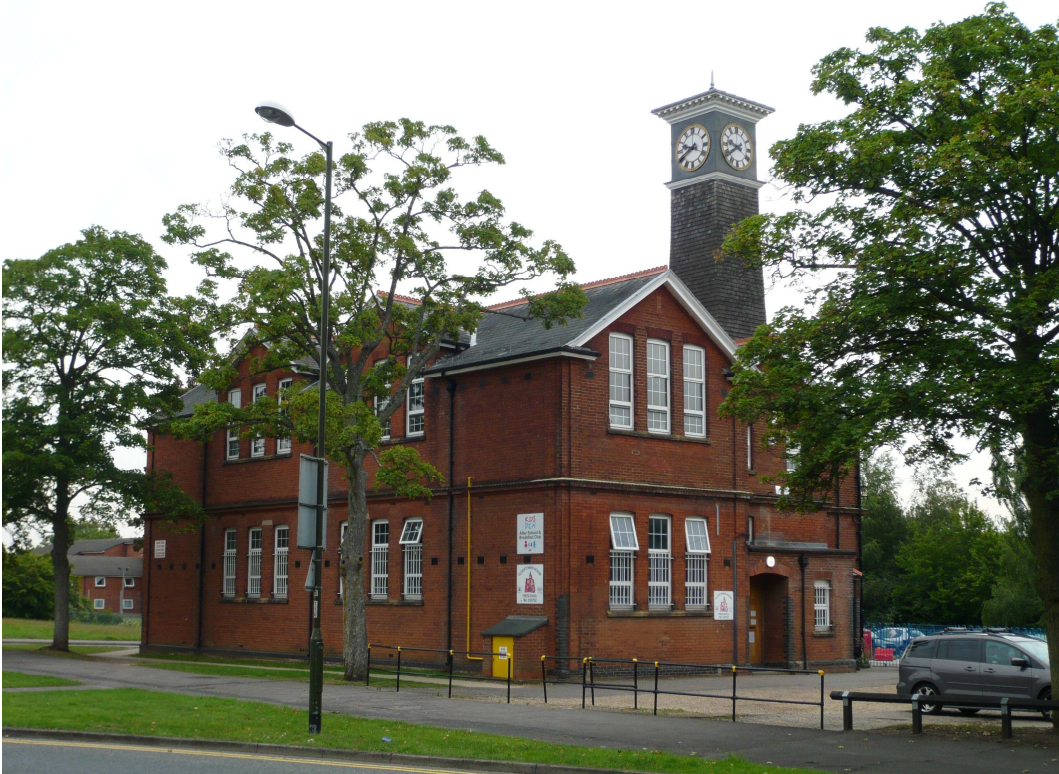
Clocktower House, Redver Buller Road – west elevation (to Queens Avenue)