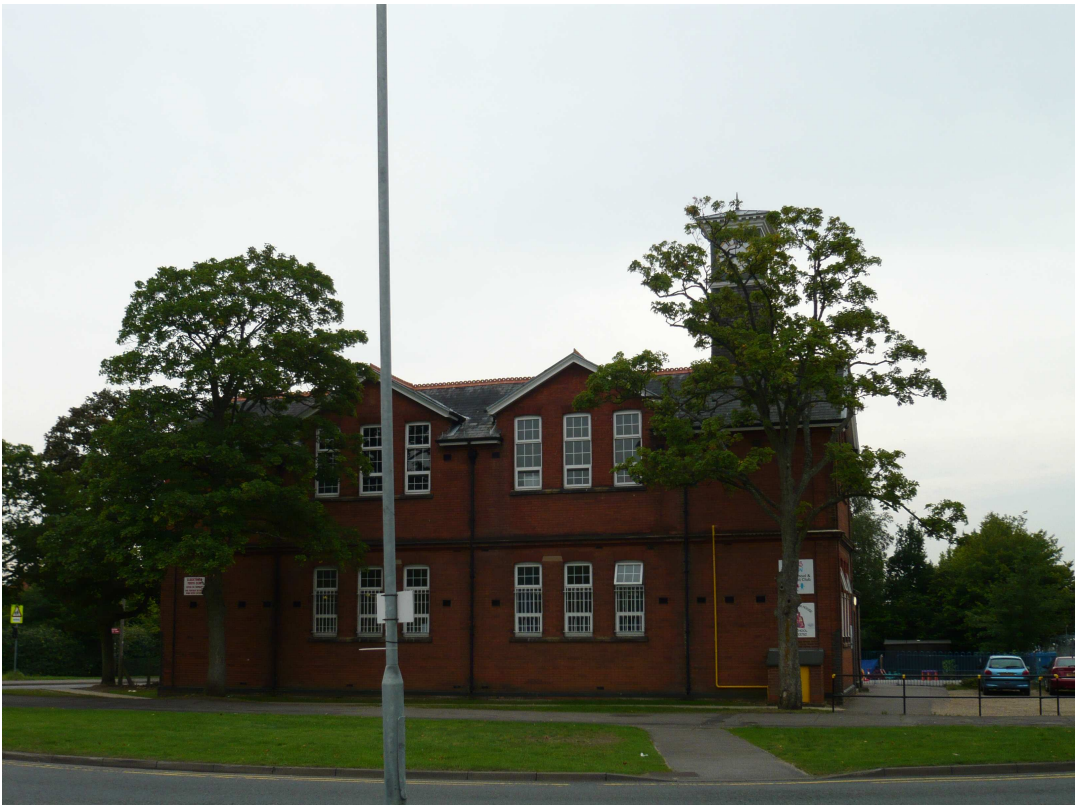
Clocktower House, Redver Buller Road – west elevation (to Queens Avenue)