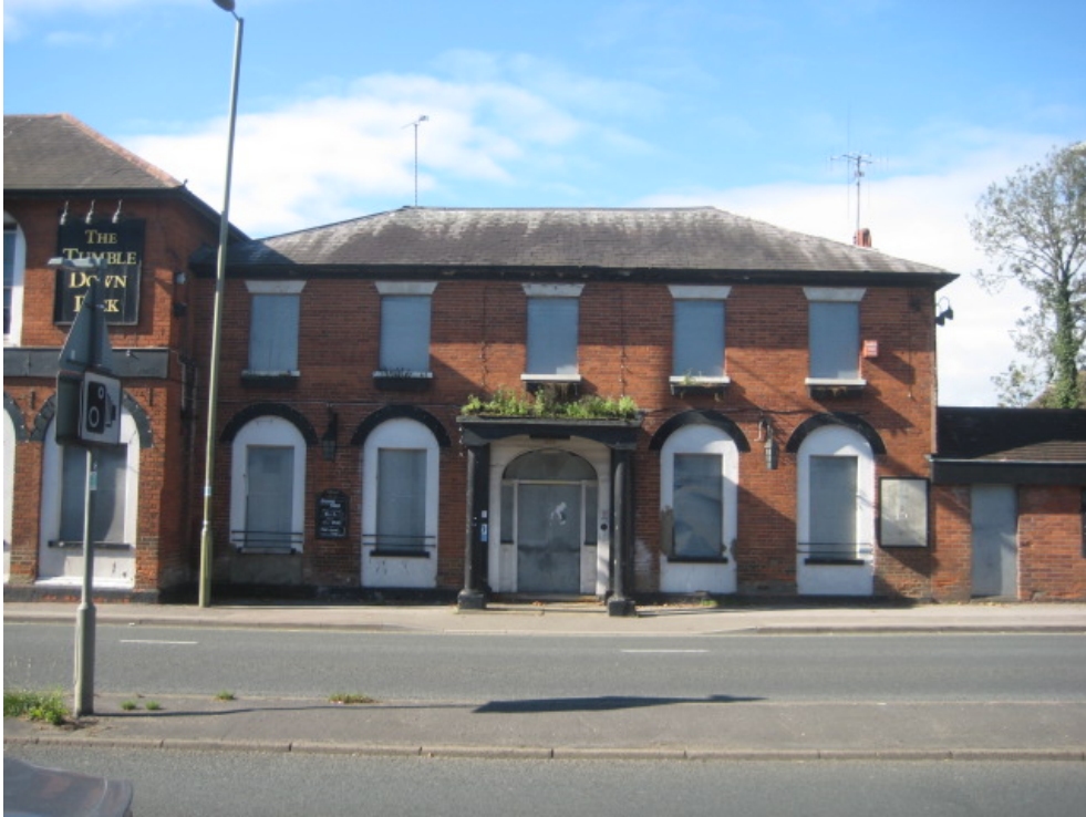
Tumbledown Dick, 227 Farnborough Road, Farnborough, GU14 7JT