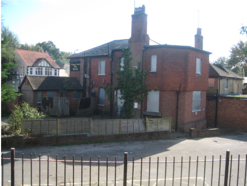
Tumbledown Dick, 227 Farnborough Road, Farnborough, GU14 7JT