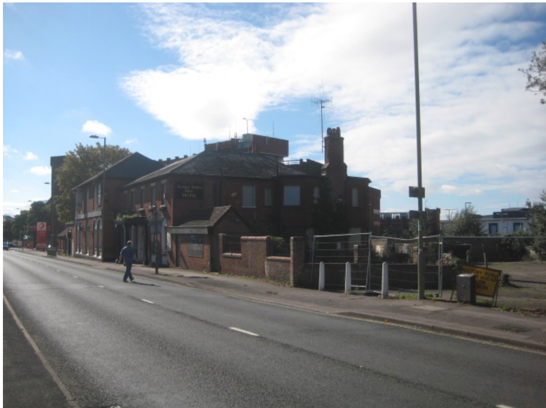
Tumbledown Dick, 227 Farnborough Road, Farnborough, GU14 7JT