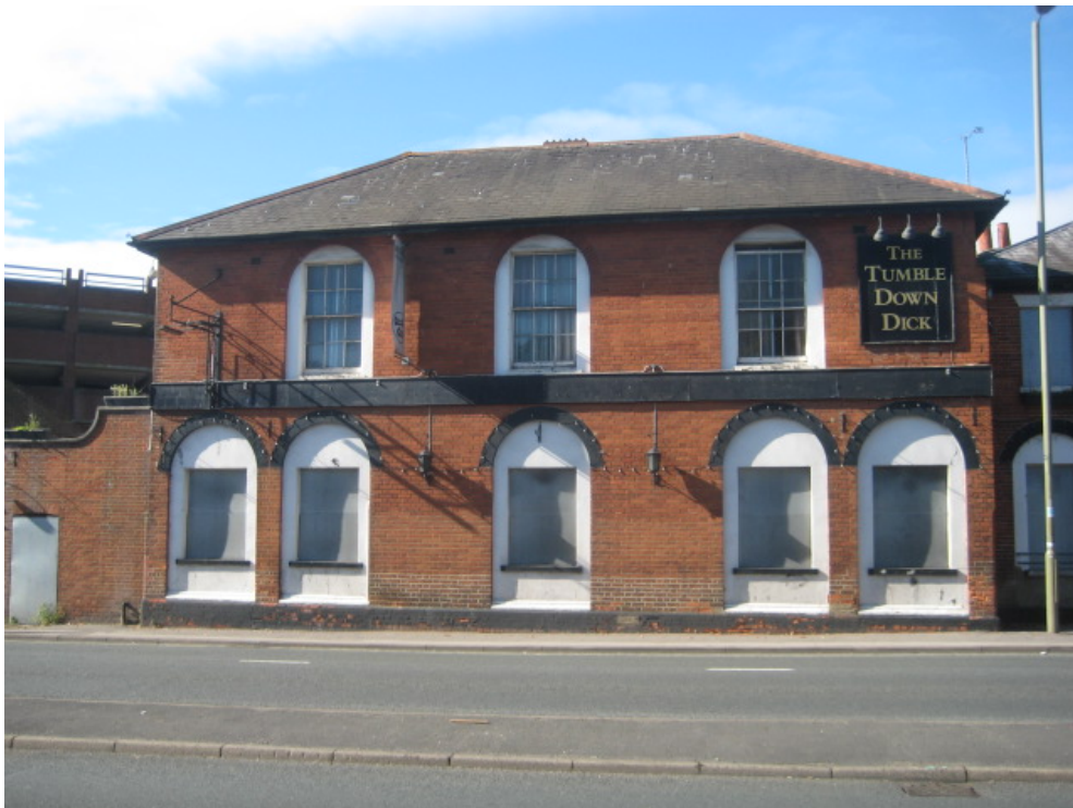
Tumbledown Dick, 227 Farnborough Road, Farnborough, GU14 7JT