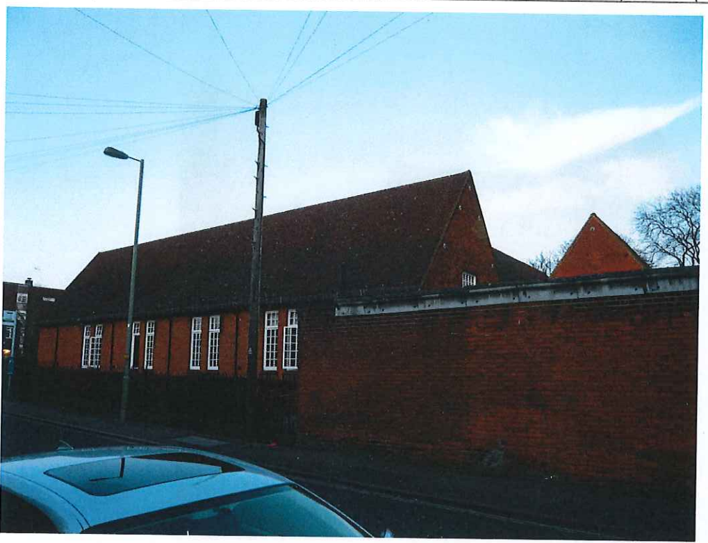
West End Infants School, York Road – west elevation