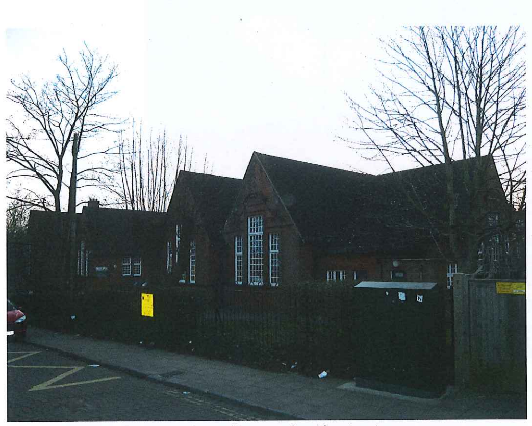
West End Infants School, York Road – west elevation (part) – west range