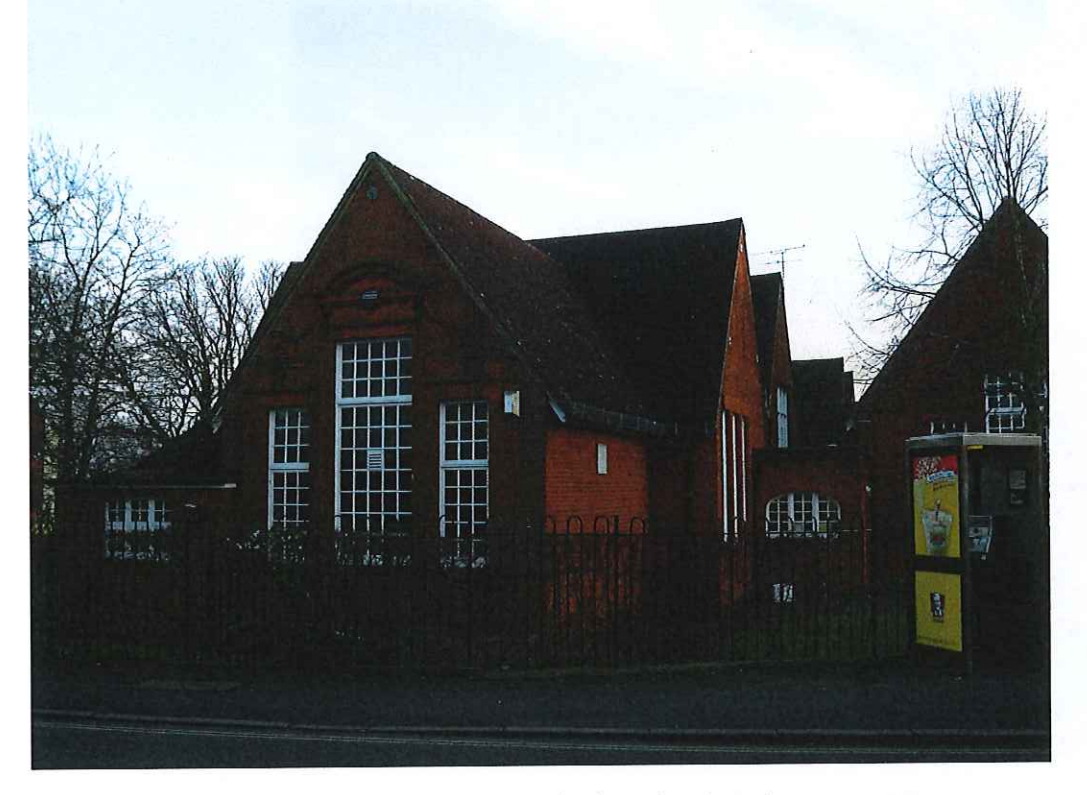
West End Infants School, York Road – north elevation (part) – east range