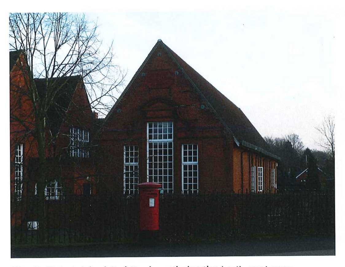
West End Infants School, York Road – north elevation (part) – west range