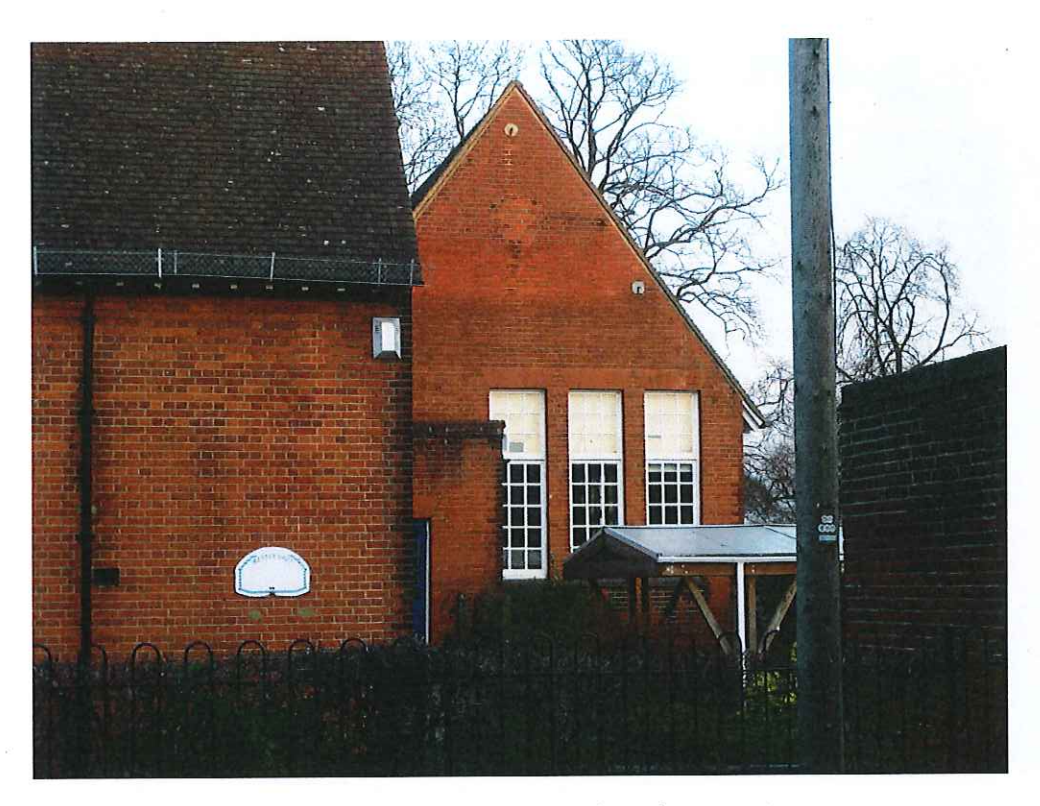
West End Infants School, York Road – west elevation (part)