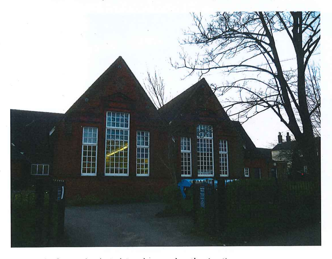
West End Infants School, York Road – east elevation (part)