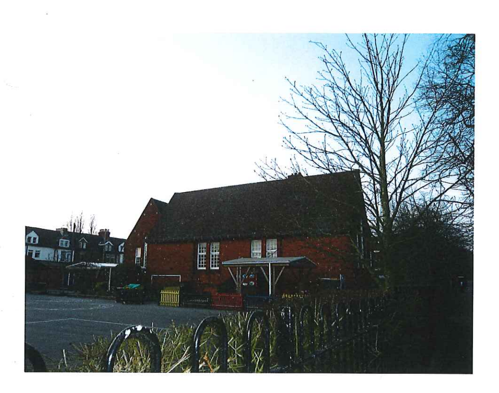
West End Infants School, York Road – south elevation (part) (to playground)