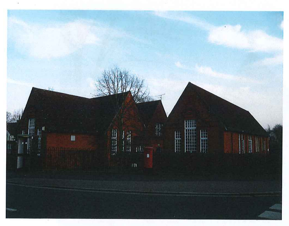
West End Infants School, York Road – north elevation – east & west ranges