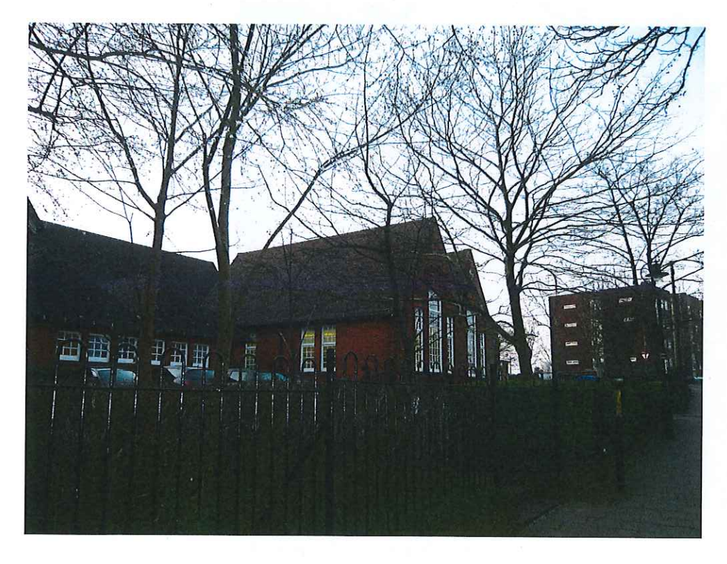
West End Infants School, York Road – east elevation (part)