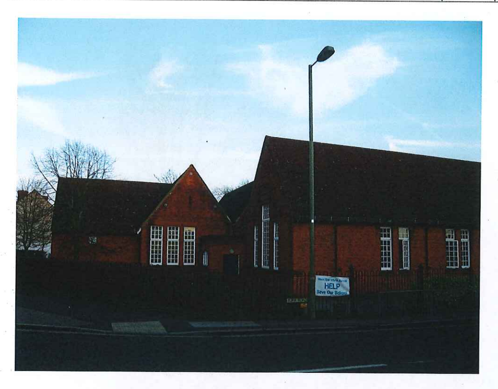
West End Infants School, York Road – west elevation east & west ranges