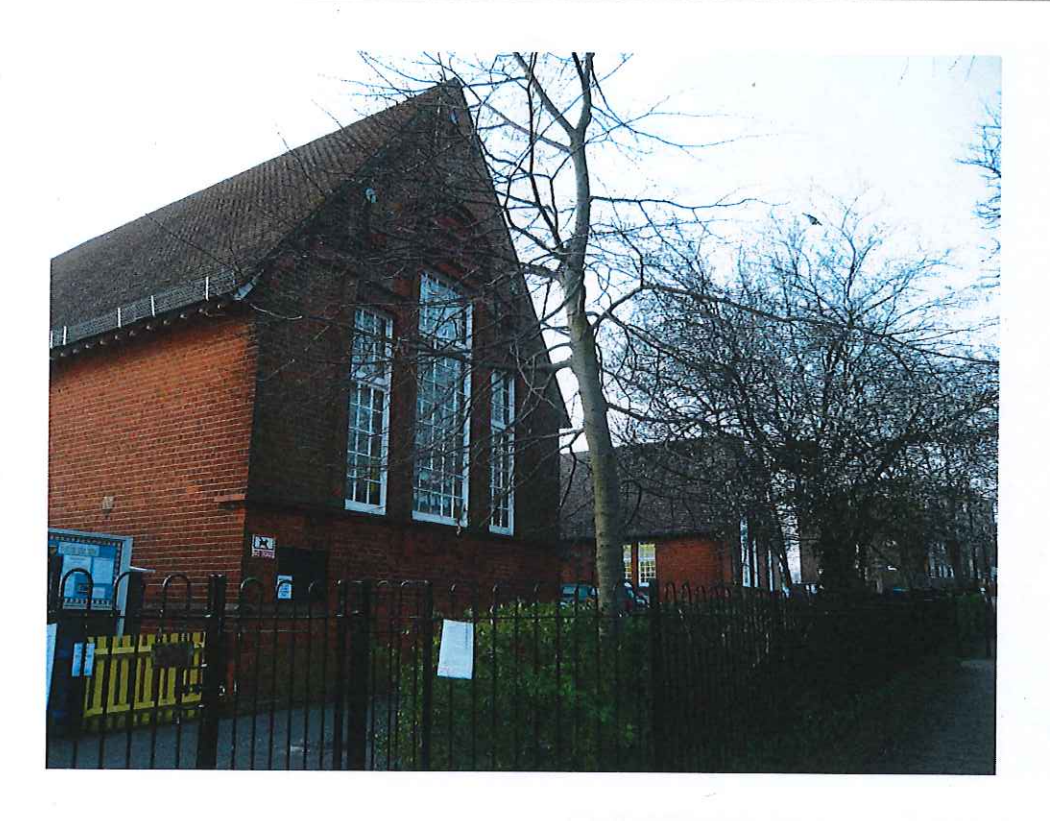
West End Infants School, York Road – east elevation (part)