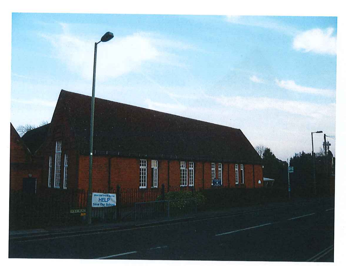
West End Infants School, York Road – west elevation