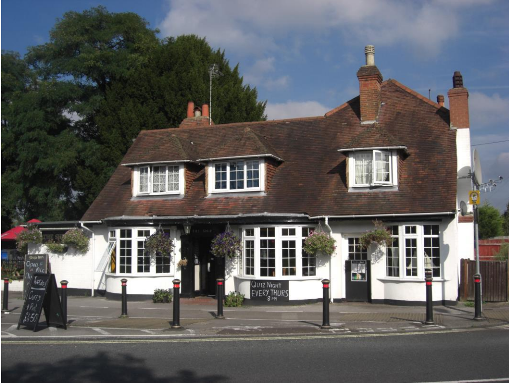
The Ship PH, Ship Lane – north elevation