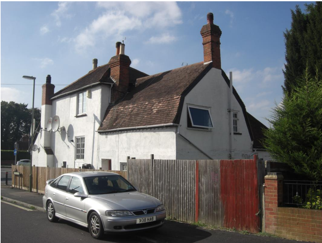
The Ship PH, Ship Lane – east elevation