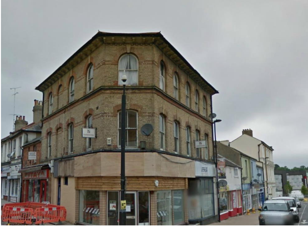
14, 16 & 16A Grosvenor Road