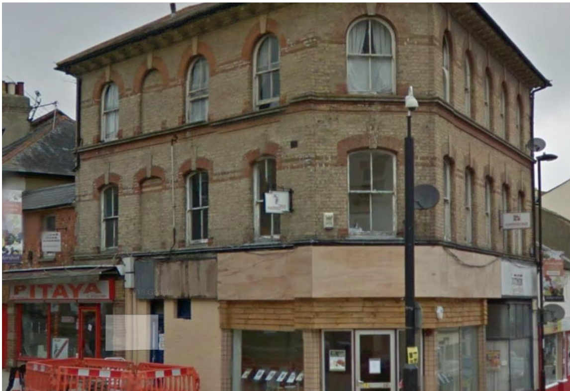
14, 16 & 16A Grosvenor Road