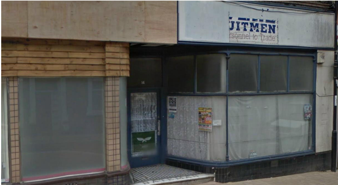
14, 16 & 16A Grosvenor Road - Shop front