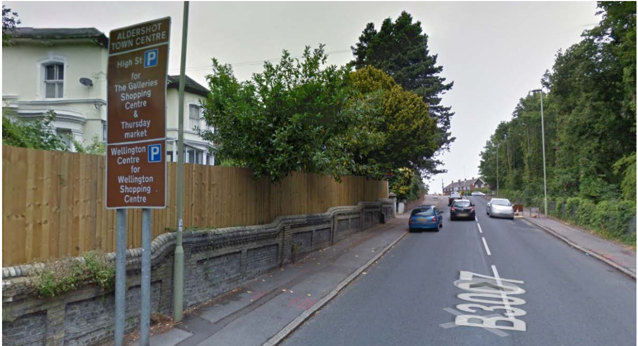
Hillside, 2 Eggars Hill