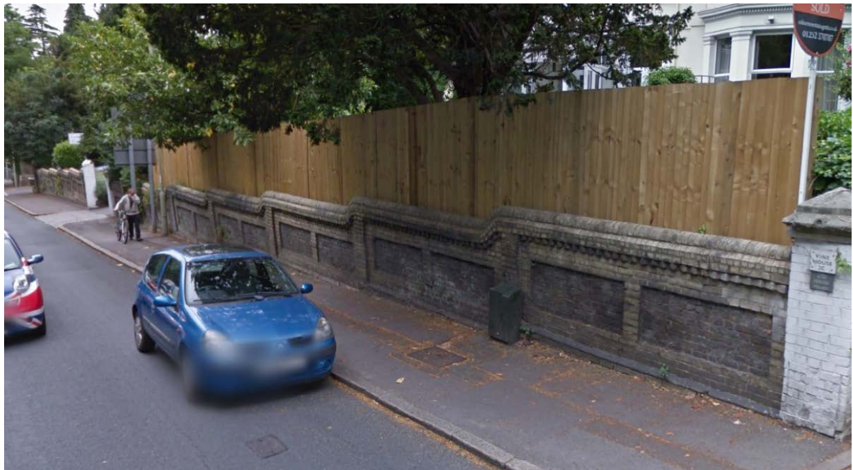
Hillside, 2 Eggars Hill