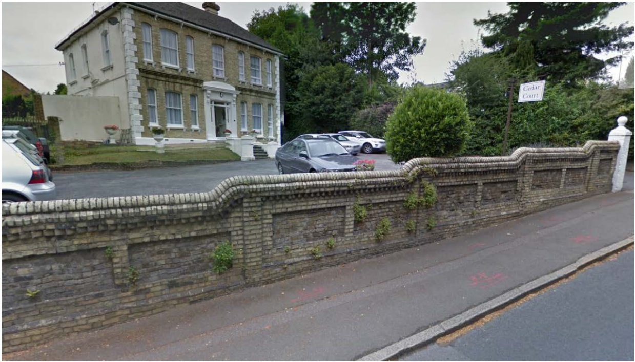
Cedar Court, 3 Eggars Hill