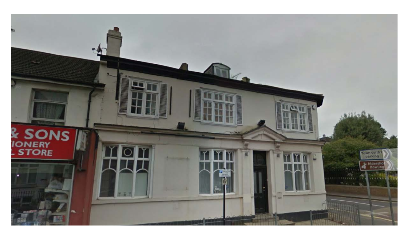
The Unicorn Public House, 32 - 34 Grosvenor Road