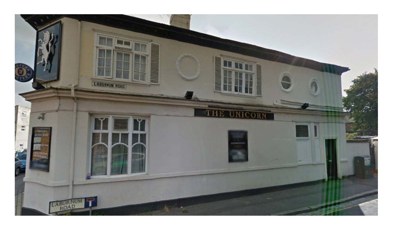
The Unicorn Public House, 32 - 34 Grosvenor Road