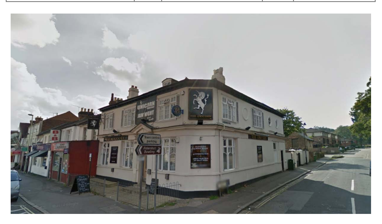
The Unicorn Public House, 32 - 34 Grosvenor Road